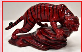
40+ Royal Doulton Flambe Figurines