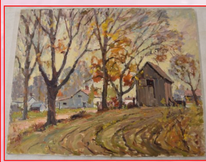
Artwork incl. Earl North