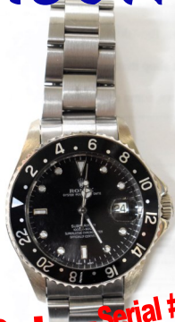
Rolex Serial # 69173

WHALEN WHALEN REALTY & AUCTION, LTD. P.O. Box 550 Neapolis, OH 43547