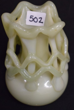
502. 4 1/2" Labino vase, custard color, w/applied open work, #61- 1965