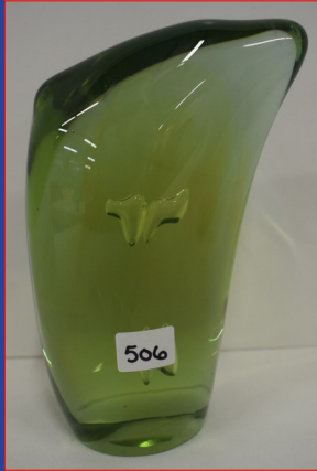
506. 6 1/2" Green Labino sculpture w/bubbles, 1969