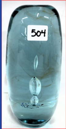
504. 7" Labino sculpture, smokey blue, 1970