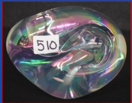
510. 3 1/2" Eickholt clear iridescent sculpture