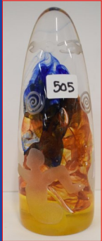
505. 6 1/2" signed sculpture.