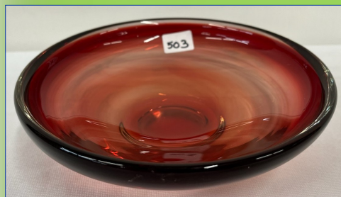
503. 6 3/4" Labino red & clear bowl, 9-1984