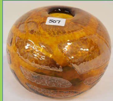
507. Amber crackle glass vase, H.J. Yarrito, 4"