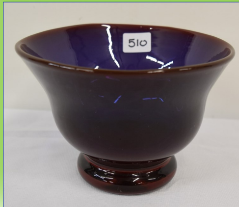
510. 5 3/4" Labino bowl, 1971. Red, blue & purple.