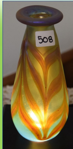
508. 6" Labino iridized pulled feather vase, 3-1970

Held at Whalen Auction Bldg., 8020 Manore Rd., Neapolis, OH (gps Grand Rapids 43522)