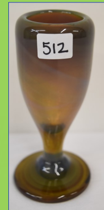
512. K. Scanlan '72 amber swirl goblet, 5"