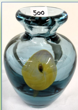
500. 1969 5 1/2" Labino blue vase w/flowers