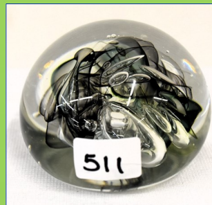
511. Lonsway 1985 paperweight, green & clear