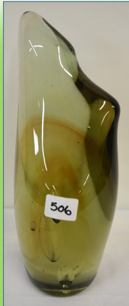
506. 8 3/4" Labino green sculpture, 1969