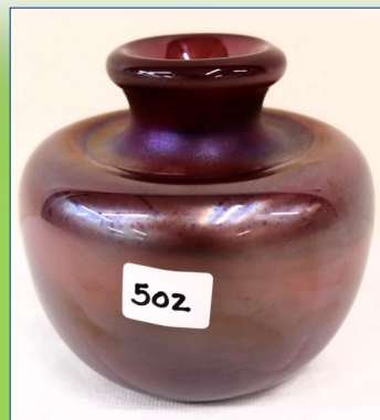
502. 4" Brian Lonsway red iridescent vase, 9-8-73