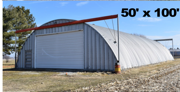
50' x 100'