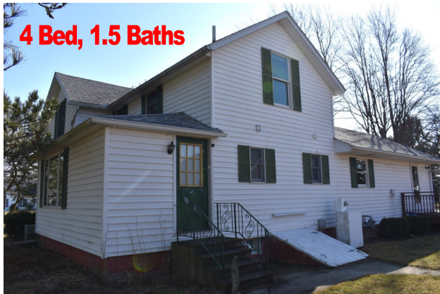
4 Bed, 1.5 Baths

Preview: Thursday March 28 from 5-6:30pm