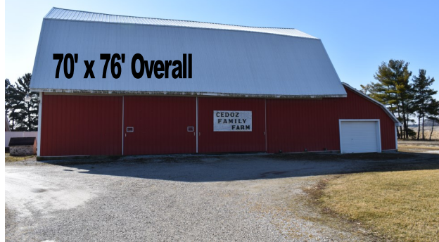
70' x 76' Overall

Preview: Thursday March 28 from 5-6:30pm