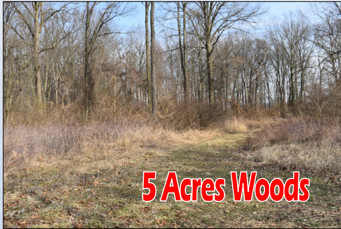
5 Acres Woods