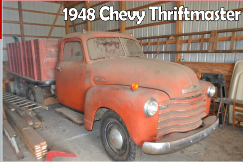
1948 Chevy Thriftmaster