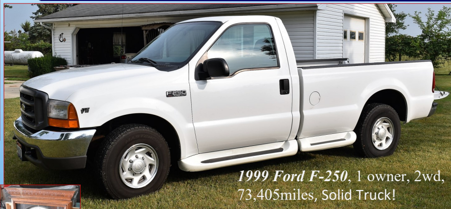
1999 Ford F-250, 1 owner, 2wd, 73,405 miles, Solid Truck!