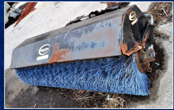
Live Only Onsite Auction