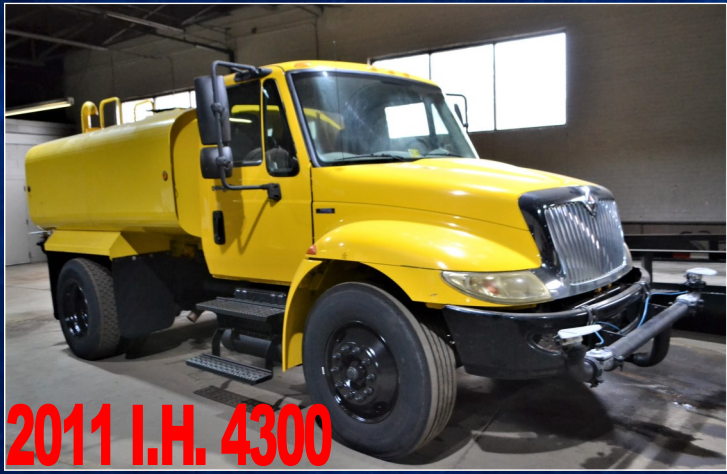
2011 I.H. 4300