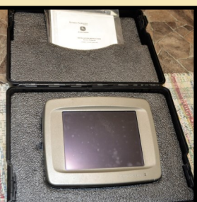
John Deere Green Star display