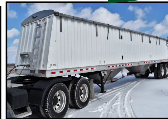
2015 Jet 42" Grain Trailer, Super Clean! Air ride suspension, Has Shure-Loc Tarp; LED lights; Aluminum rims; 68,000 GVW; 11R-24.5 Tires