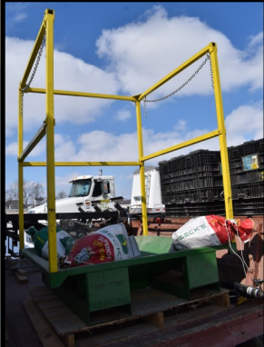
Seed Bag Frame, fork mount Seed frame filler