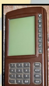
John Deere Green Star display

Wagon Loads Of Smalls & Items Around The Farm