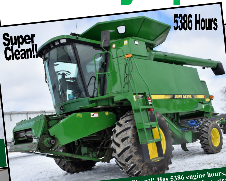
Super Clean!! 5386 Hours 1990 John Deere 9500 Combine, Super Clean!!! Has 5386 engine hours, 3474 Separator hours, Maurer grain extension, 2wd, 30.5L-32 tires, straw Chopper, "The Spreader" Chaff spreader; LED Lights.