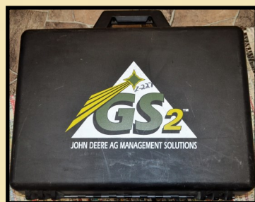
John Deere 2600 Display, new in 2011, Green star 2 with case, has basics swath control pro