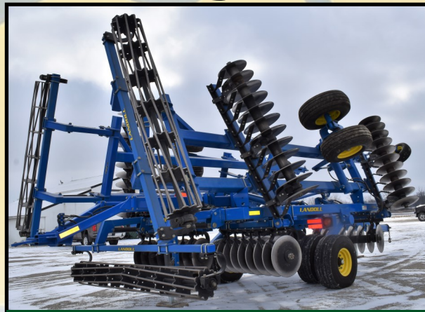
2017 Landoll 7431 VT Plus Vertical Till, 24' width, 22" disc with 7" spacing, rear baskets, Walking Tandems, Rear hitch with light and Hydraulic outlet