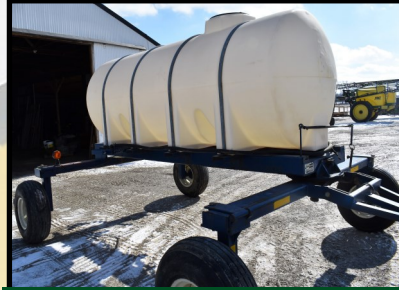
Duo Lift Nurse Wagon, 1025 gallon; 33" ground clearance, hydraulic pump, adjustable width, fifth wheel steering, lights not included