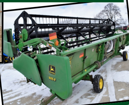
2001 John Deere 25' 925 F Platform, Full poly skids, full finger. 25' width, clean and straight