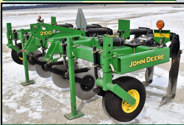
2011 John Deere 2100 Minimum Till Ripper, Like New!!! 5 Shank, 3 point, lights