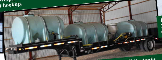
2005 Jet 36' Liquid Tender Trailer, Selling with all the tanks and pump! Trailer has 26,000 GVW, single axle w/ 8.25x22.5 tires, fifth wheel, air brakes, 7 pole round light connection, rub rail, flip up ramps, wood deck, its 10' on the top deck, 21' on drop deck & 5' beaver. Comes with (3) 1035 Gallon tanks on steel frames, Monarch 5.5 h.p. pump, Induction tank, small wash tank, Caged tote tank.