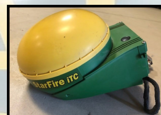
John Deere ITC Receiver