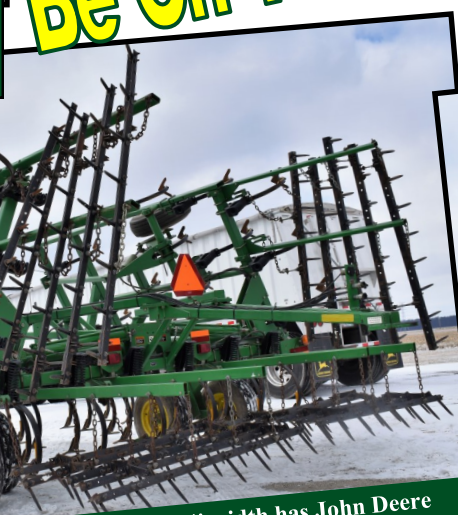
2004 John Deere 980 Field Cultivator, 24' width has John Deere 9" sweeps, 5 bar harrow, poly shank guards, has rear hitch and light hookup.