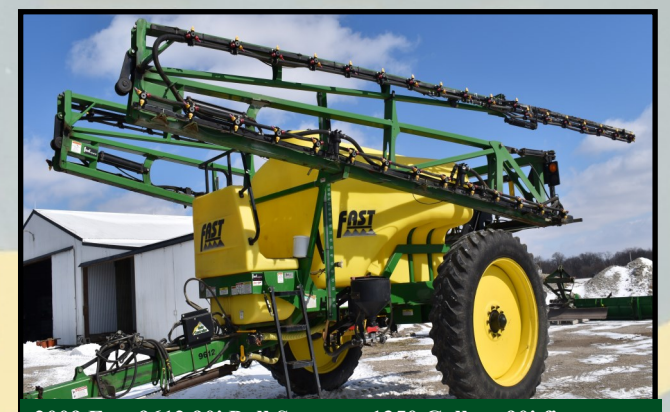
2009 Fast 9612 90' Pull Sprayer, 1350 Gallon, 90' five section boom, Tee Jet three way nozzle body, hydraulic expandable hitch, Titan 14.9-R46 tires, 15" nozzle spacing, Comes with Raven SCS 440 NVM controller

Terms: Cash or check w/I.D., credit/debit cards accepted with 3% processing fee. Buying at auction and in "as is" condition, no warranties or guarantees on items sold. If buyer is obtaining financing, all financing approval must be done prior to auction. Everything must be paid in full prior to pick up. Lunch by Sandy's. Pick up dates: Sunday April 10th from 10-12:00pm, Monday April 11th from 9-2:00pm, by appointment thereafter. Buyer responsible for items after the auction. Separate terms apply for online bidders.