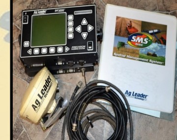
AG Leader PF 3000 Display with receiver