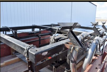
Yetter Seed Jet 2 Seed Blower