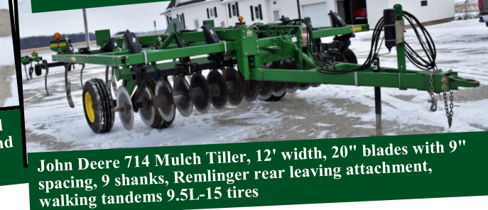
John Deere 714 Mulch Tiller, 12' width, 20" blades with 9" spacing, 9 shanks, Remlinger rear leaving attachment, walking tandems 9.5L-15 tires