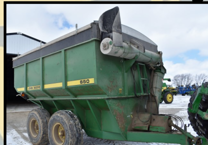
John Deere 650 Grain Cart, Has roll tarp, 1000 P.T.O, Lights, 49x17 tires, 12" unload auger