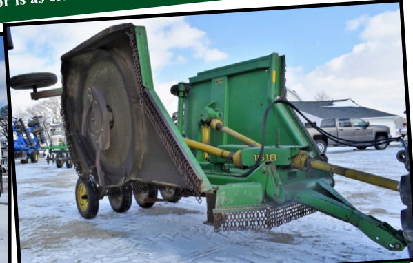
2010 John Deere 1518 Batwing Rotary Cutter, 15', 1000 P.T.O.; 5.9-15 Tires