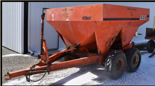
Wilmar 500 Fertilizer Cart