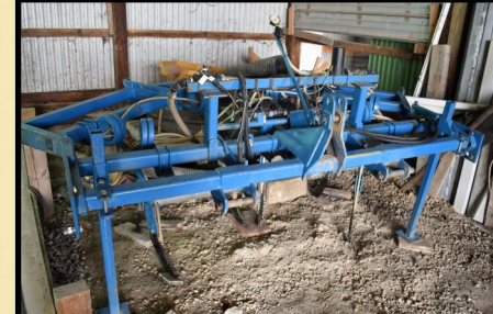
8 Bar Applicator, 3 point, homemade