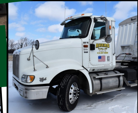
2007 International 9400i Eagle Semi, 874,888 miles; ISX 400T Cummins, 10 speed Eaton Fuller trans; Aluminum rims; 295/75R 22.5 fronts; Firestone FD663 295/75R 22.5 rears; This truck is solid as they come with good rubber on front and back! Road ready and drive anywhere! CB radio not included