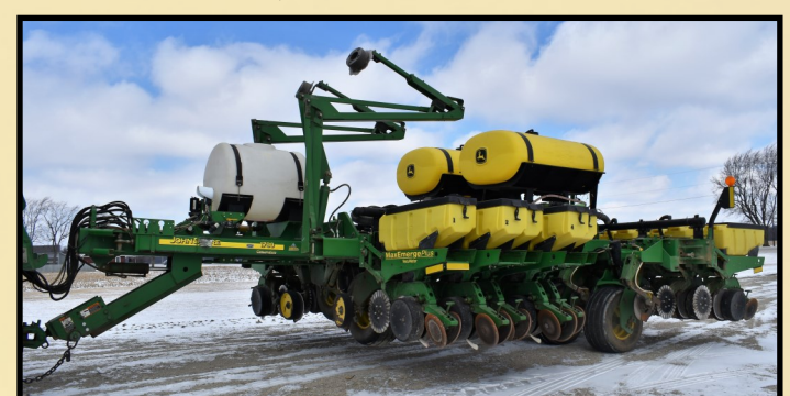
2002 John Deere 1780 12/23 Conservation Planter, MaxEmerge Plus, Vacuumer, Liquid Fertilizer on row with deep placement, forward folding, markers, has two sets of corn plates and one set for beans: John Deere wave coulters,