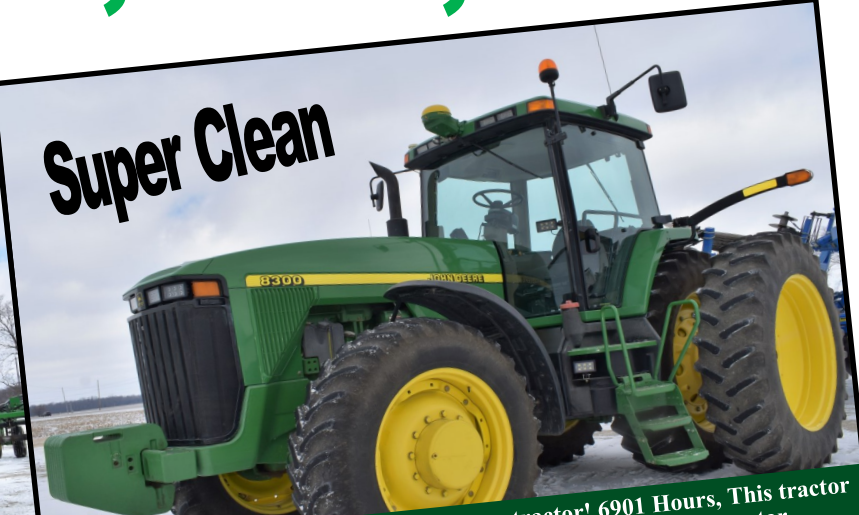
Super Clean 1999 John Deere 8300 MFWD, Super clean tractor! 6901 Hours, This tractor is selling with the 3000 starfire receiver with SF1 activation, Greenstar processor and Auto trac 200!! Powershift, (8) 47KG front weights, Beacon, LED lights, John Deere front fenders, hammer strap, 1000 P.T.O. 4 SCV's, Quick Hitch, (8) 205 KG inside wheel weights, 480/80R 46 rears, 380/85R34 fronts. This tractor is as clean as you can find! Back up camera not included.

The Late Eugene Avers 1591 Fremont Pike Perrysburg, OH 43551 Directions: East of Perrysburg, OH on Fremont Pike (Rt 20)