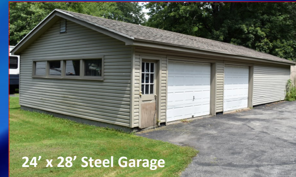
24' x 28' Steel Garage

Carpet Carpet, fireplace Ceiling fan Carpet, closet Carpet, closet Full