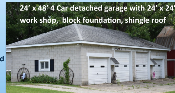
24' x 48' 4 Car detached garage with 24' x 24' work shop, block foundation, shingle roof

Living Room: 10'10 x 24'5 Linoleum Floor, open to kitchen Kitchen: 11' x 12' Appliances stay Dining Room: 10'10 x 11' Linoleum floor Master Bedroom: 15'5 x 11' Carpet, walk in closet Master Bath: 8'11x 8'11 Bedroom: 12' x 11' Carpet, closet Bedroom: 8'8 x 12'11 Carpet, closet Full Bath: 5' x 8' Laundry Electric washer & dryer stay Foundation: Block press w/cement block skirting Water: Drilled Well, located west of house in front yard Septic: Located east of house Heating: Propane Air: None Water Heater: 30gal. electric Electric: Toledo Edison