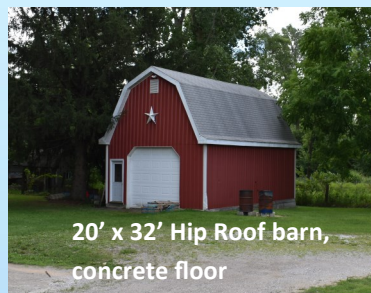
20' x 32' Hip Roof barn, concrete floor

2018 Mojave Adventure Model 3523F, 24' x 64' double wide.