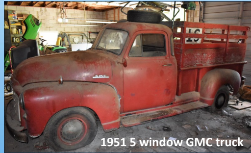
1951 5 window GMC truck