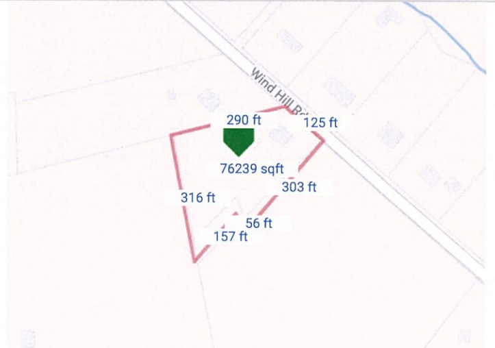
200 ft Report a map error