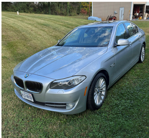
2011 BMW 535i xDrive Sedan 34,000 miles Vin # WBAFU7C58BC878031 Excellent Condition