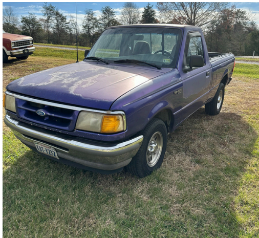
1995 Ford Ranger Pickup Truck 459,811 miles Vin # 1FTCR10A9SUB87140