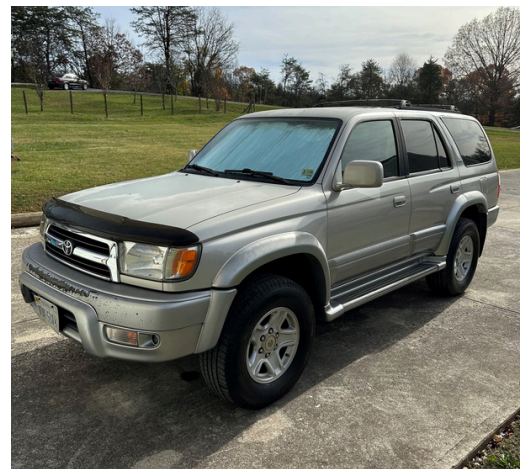
1999 Toyota 4 Runner Limited 297,405 miles Vin # JT3HN87R8X0207953 One owner