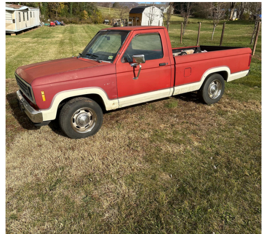
1987 Ford Ranger Vin # 1FTBR10TXHUC67620 Needs Transmission Work