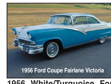
1956 Ford Coupe Fairlane Victoria

1952 Robin Egg Blue Mercury Monterey, Hardtop, V-8 Flat-head Engine, Restored, Uph., Frame, Paint, 8,632 miles