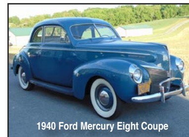
1940 Ford Mercury Eight Coupe

1953 Cadet Blue Model 3100 Chevrolet Truck, V-8, PS, PB, Automatic, Disc Brakes, New Frame, 36,052 mls.