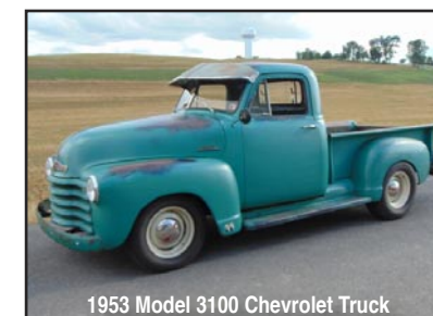
1953 Model 3100 Chevrolet Truck

1930 - 2 Tone Olive Green/Black with Lime Rims Ford Model A Sedan, Excellent Condition, Mitchell Overdrive, Flat-head 4 Cylinder Engine, SS Exhaust, Completely Restored Engine, Interior, Body, New Vinyl Top, Alternator, 193 Miles