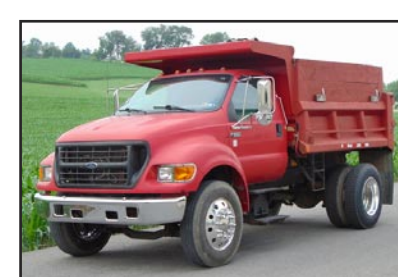
2000 Ford F-650XL Super Duty Dump Truck

1951 Seafoam Light Green Ford Custom Sedan, Flathead V-8, Alternator, 30,823 miles