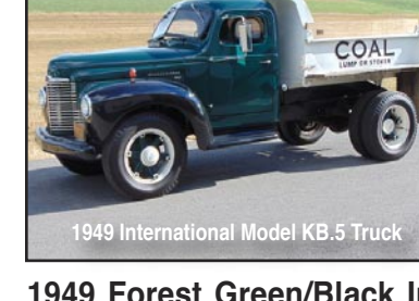
1949 International Model KB.5 Truck

1940 Slate Blue Ford Mercury Eight Coupe, V-8, Flat-head 24 Studheads, New Interior, 52,166 miles (Received Various Awards)