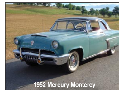
1952 Mercury Monterey

1952 Robin Egg Blue Mercury Monterey, Hardtop, V-8 Flat-head Engine, Restored, Uph., Frame, Paint, 8,632 miles