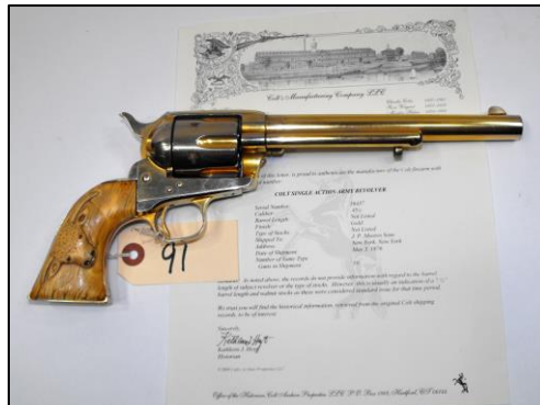
COLT SAA 45 SOLD FOR $14,850