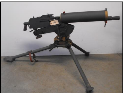
1928 COLT BROWNING 30 CAL. SOLD FOR $5,775.00