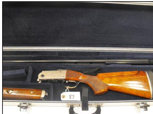
KRIEGHOFF K-80 12 GA. TRAP SOLD FOR $7,150.00