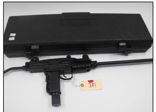
IMI UZI CORBINE 9MM SOLD FOR $3,190.00