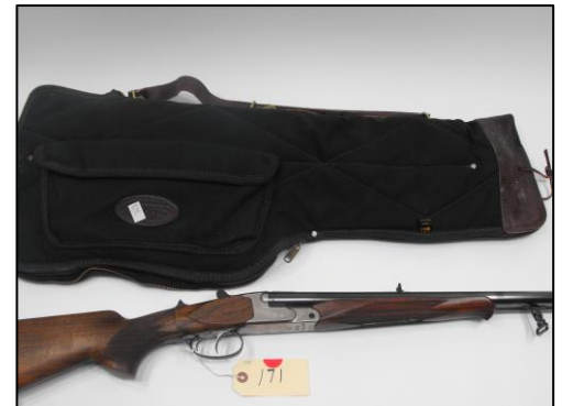
KRIEGHOFF CLASSIC 470 NITRO SOLD FOR $6,930.00