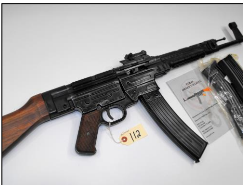
SPORT SYSTEM DITTRICH PTR-44 SOLD FOR $5,940.00

***PRICE REALIZED INCLUDES 10% BUYERS PREMIUM***