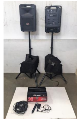
Good, Used SM-4C Sound Projection Speaker System