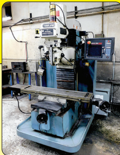
SWI Trak Model DPM-3 CNC Vertical Bed Mill