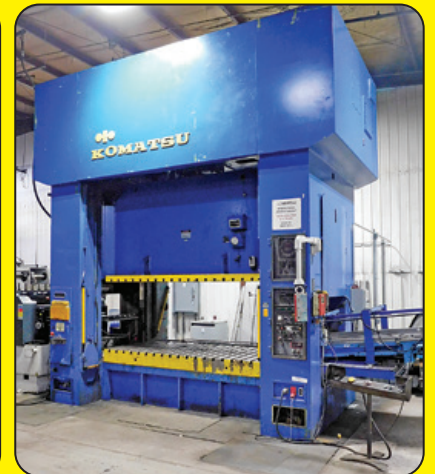
500 Komatsu ESP-500 Straight Side Press