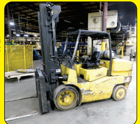
Hoist Model Titan F180 Forklift