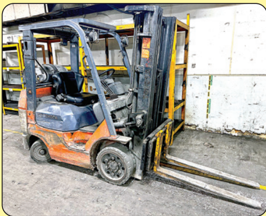
Toyota Model 7FGU25 Forklift