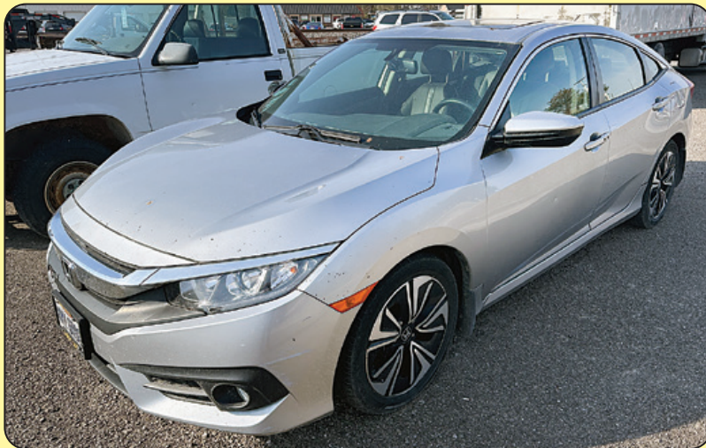
2018 Honda Civic