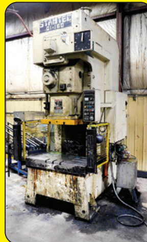
Stamtec Model G1-160 Gap Frame Press

937-426-8446 • www.thompsonauctioneers.com