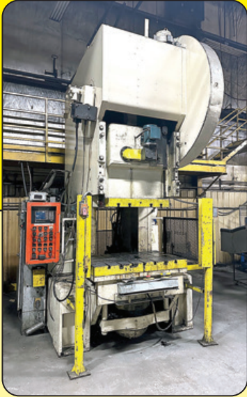
Bliss Gap Frame Press