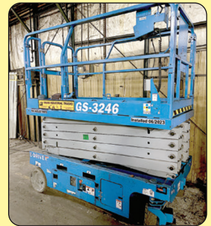
Genie Model GS3246 Scissor Lift