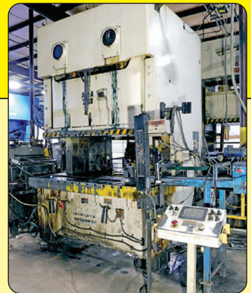
Aida Model NC2-2000(2) Gap Frame Press