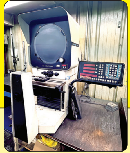
Deltronic Model DH214 Optical Comparator,