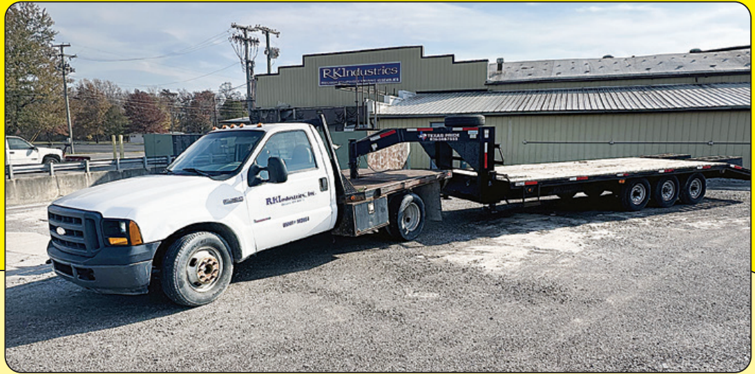
Ford F350XL Flat Bed Truck and Texas Pride Model FT8205-21KGN Flat Bed Trailer (sells separately)