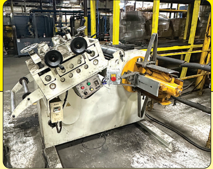
Tomac Model TGL-400 Combination Feeder/Straightener/Coil Reel