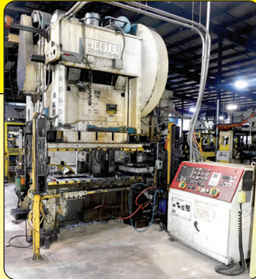
Minster Model G2-150-72-30 Gap Frame Press