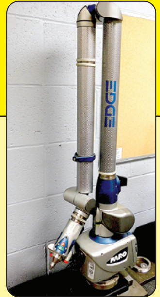
Faro Edge Portable Coordinate Measuring Machine Arm