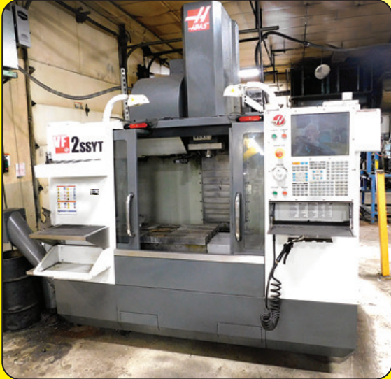
Haas VF-2SSYT CNC Vertical Machining Center, New 2013

Auction Begins Closing TUESDAY, DEC. 3 9:00 AM ET