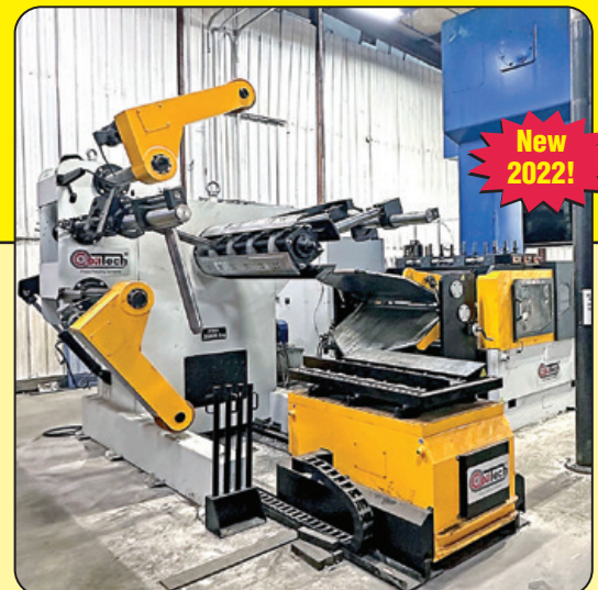
Coiltech Model CMKS-A125-1300-2D-15T Compact Servo Feed Line, New 2022