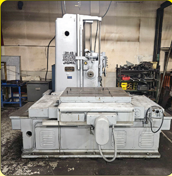
Devlieg Model 3H-48 Horizontal Jig Mill,