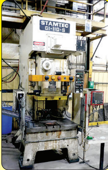
Stamtec Model G1-110-S Gap Frame Press