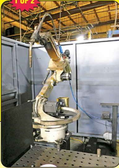
OTC Robotic Welding Cell, Model ECO-ARC 200, New 2022