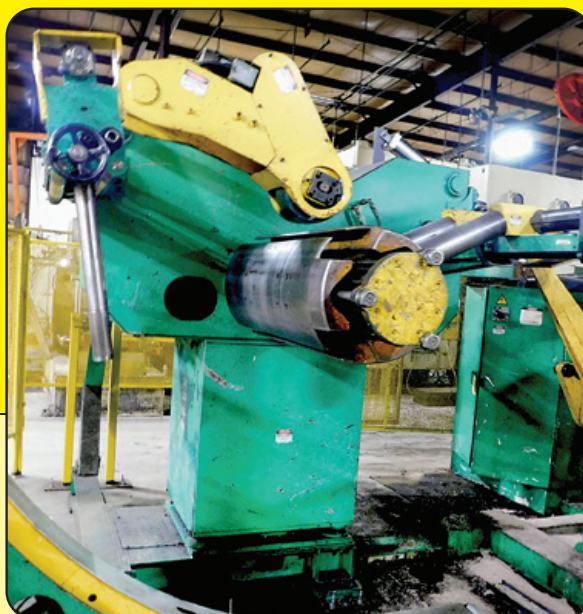
Dallas Double Arm 20,000 Lb. Coil Reel