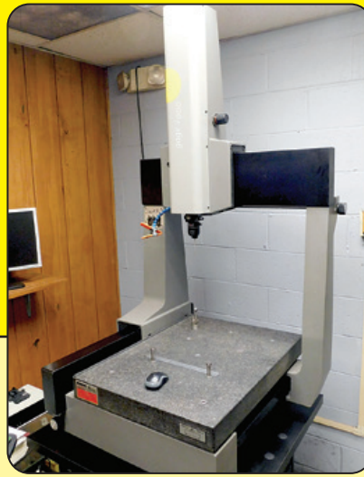
Brown & Sharpe Gage 2000 Coordinate Measuring Machine