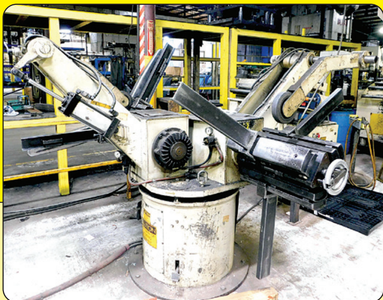
Coe Double Arm 4,000 Lb. Coil Reel