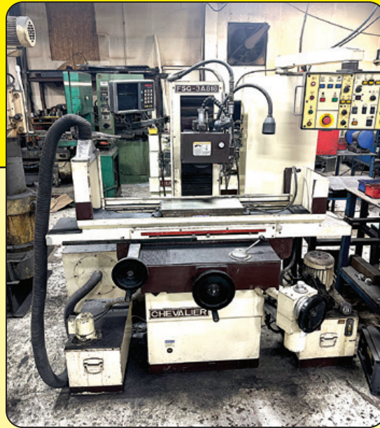
Chevalier Model FSG-3A818 Automatic Surface Grinder