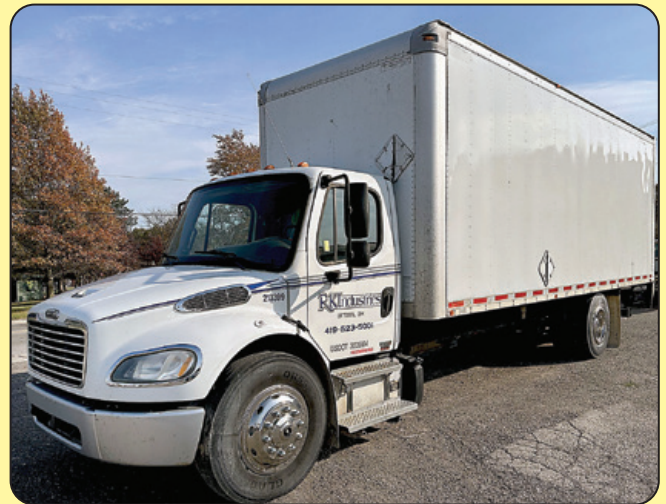
2011 Freightliner Box Truck

THOMPSON Auctioneers, Inc. 937-426-8446 • thompsonauctioneers.com