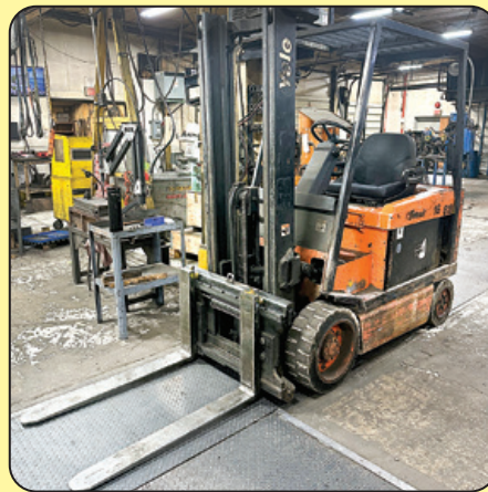
Yale Model ERC065ZFN48SF088 Electric Forklift