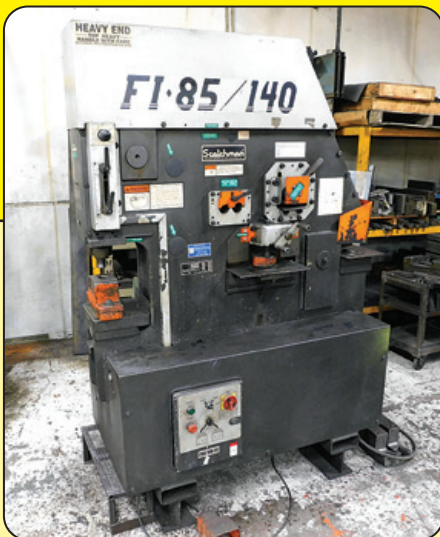
Scotchman Model FI 85/140 Hydraulic Ironworker

Inspection: Monday, December 2, 9:00 am - 4:00 pm