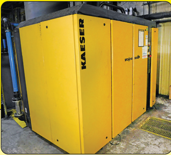
Kaeser Model SFC-110 Sigma Rotary Screw Air Compressor