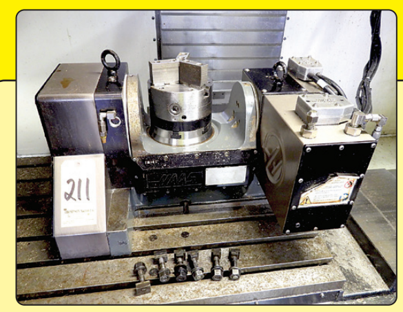
Haas Model TR-160 Trunion Style CNC Indexer

Mitutoyo Model PH-A14 Optical Comparator