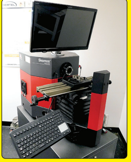
Starrett HDV-300 Video Measuring System