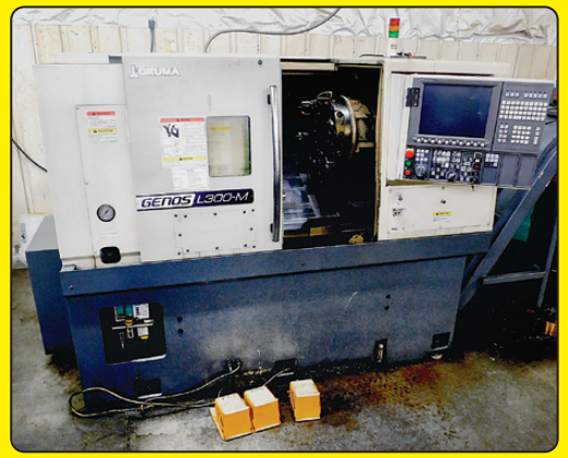
Okuma Genos L300M CNC Turning Center with Milling, New 2012

Haas VF-5SS CNC Vertical Machining Center, New 2007