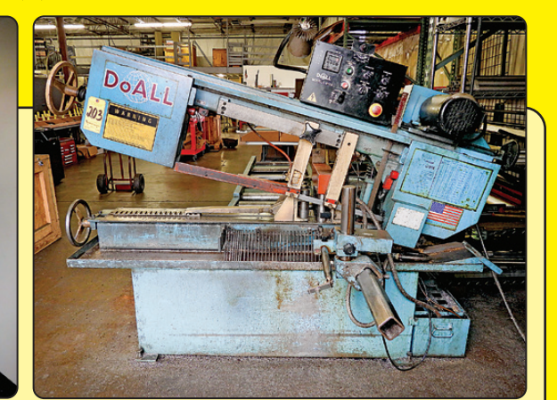
Do-All Model C-916A Semi-Automatic Horizontal Band Saw

Mitutoyo Model PH-A14 Optical Comparator