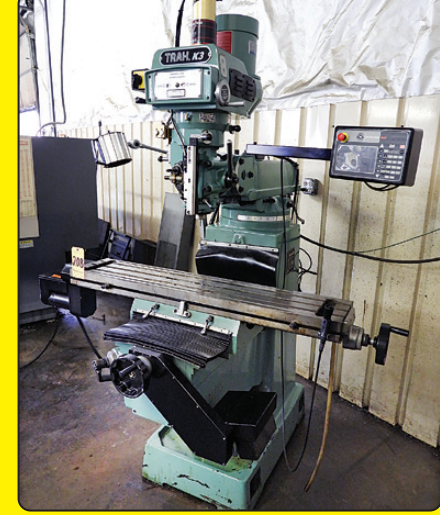
SWI Trak Model K3 CNC Vertical Mill