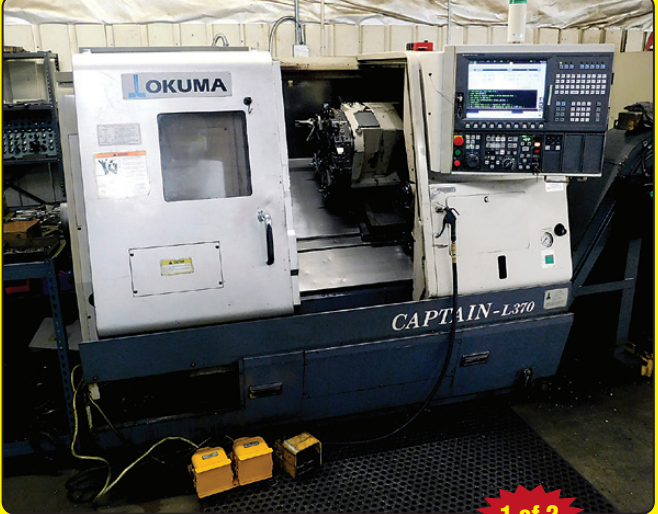
Okuma Model Captain L370 CNC Turning Center