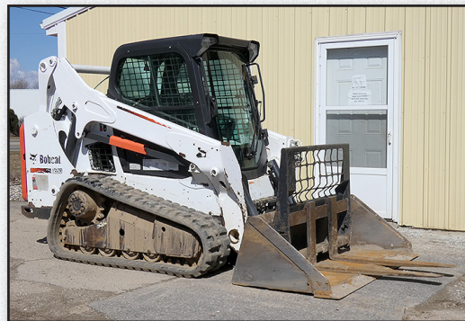
2015 Bobcat T590 Crawler Skidloader