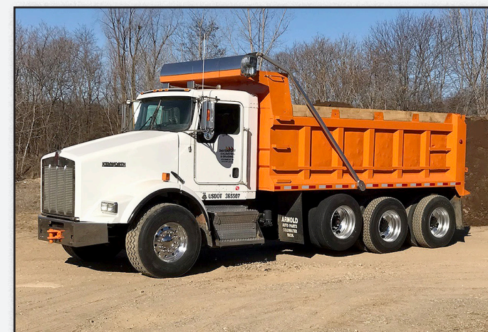
2005 Kenworth T800 Triaxle Dump Truck