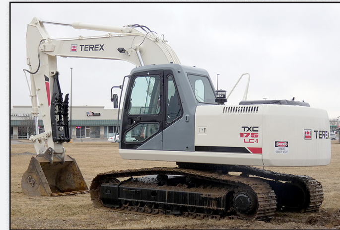
2005 Terex TXC175-1 Hydraulic Excavator