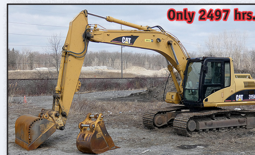
2005 Caterpillar 315CL Hydraulic Excavator

2002 Prowler Lite 25' Travel Trailer, SN:63636