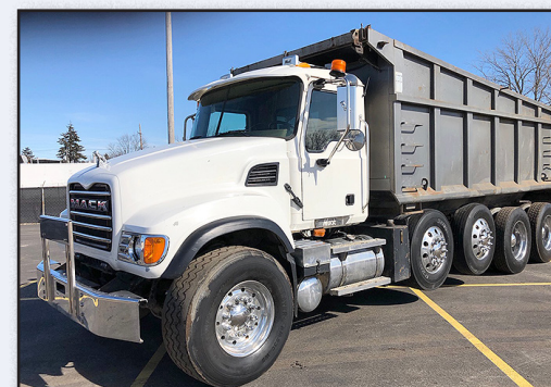
2004 Mack Quad Axle Dump Truck