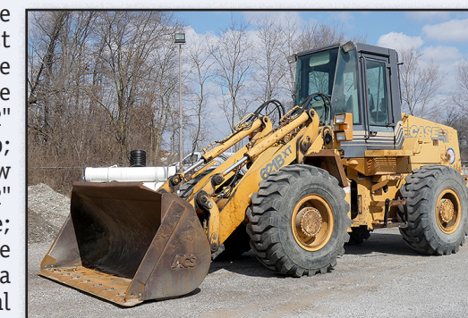
1998 Case 621B XT Rubber Tired Loader