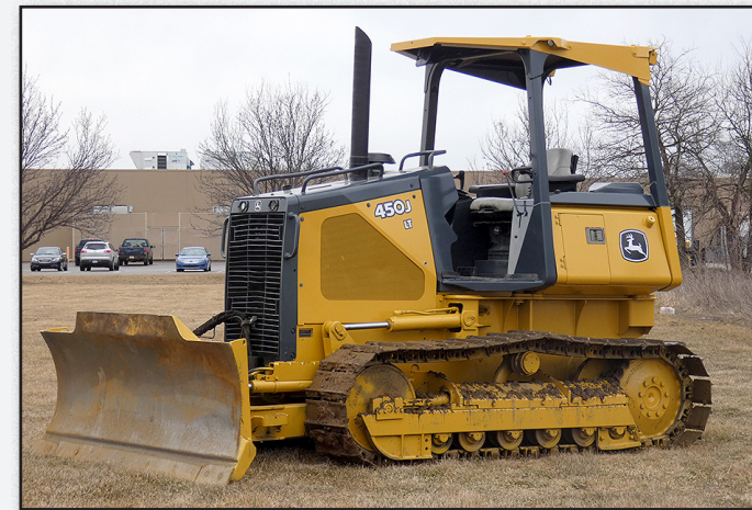
2005 John Deere 450J LT Dozer