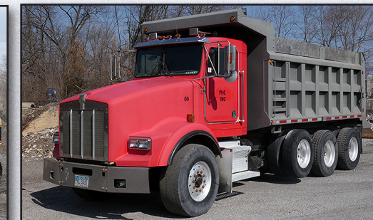
1998 Kenworth T800 Triaxle Dump Truck