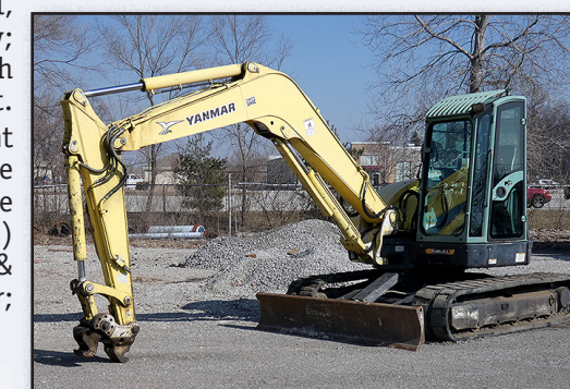
2007 Yanmar V1075 Mini Excavator