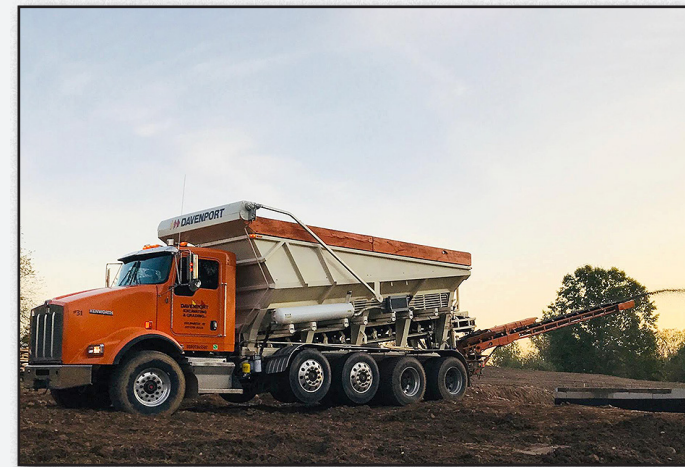
2005 Kenworth / Dahm Super 18XL Stone Slinger

1987 Ford L9000 Triaxle Cab & Chassis SN:HVA07027, Cummins, 8 Speed, with Dump Cylinder - no bed, 810,000 miles.