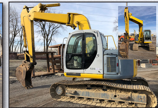
2004 Kobelco SK135SR Offset Boom Excavator