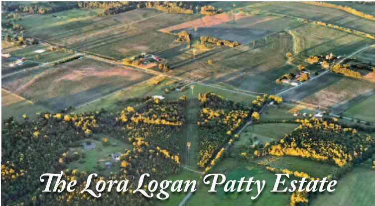
The Lora Logan Patty Estate

Located in the Friendship Community at the intersection of County Road 45 & County Road 162