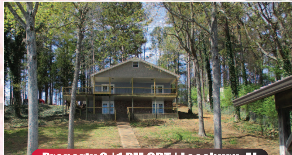
Property 2 | 1 PM CDT | Leesburg, AL