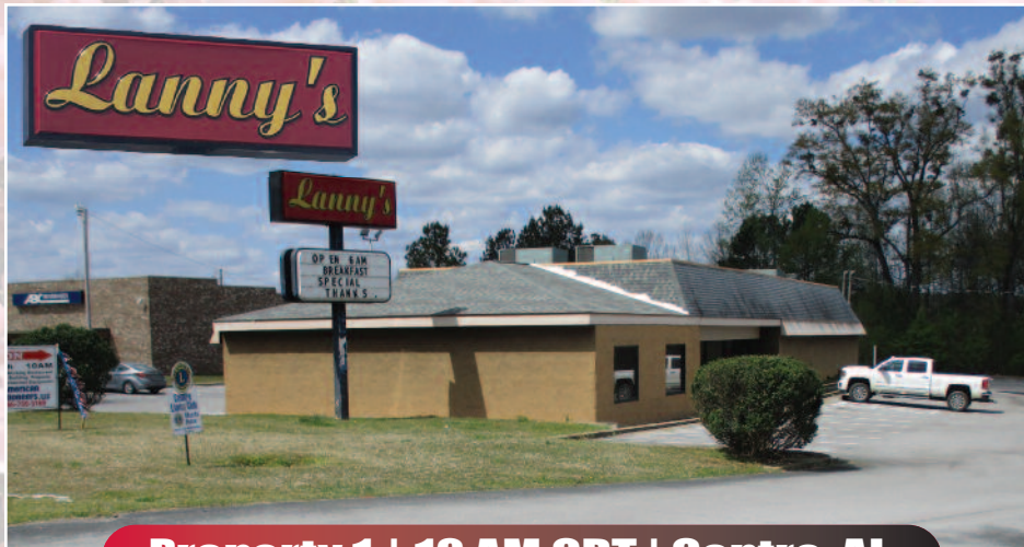
Property 1 | 10 AM CDT | Centre, AL