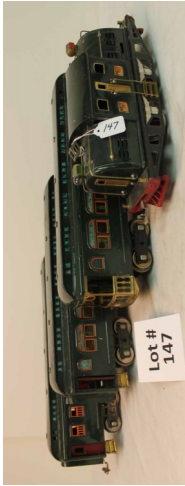
Lot # 147

643 Kriner Road, Chambersburg, PA 17202 Phone: (717) 263-6512 (800) 315-3265, Fax: (717) 263-0188 Email: bid@gatewayauction.com