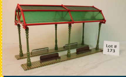
Lot # 173