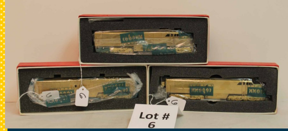
Lot # 6