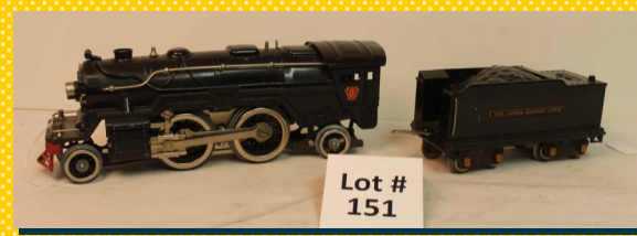
Lot # 151