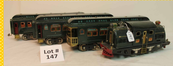
Lot # 147