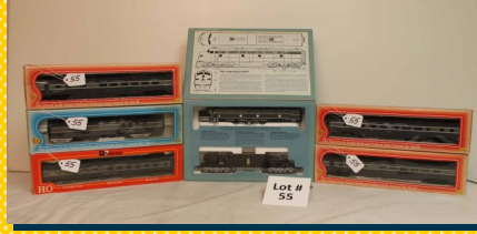
Lot # 55