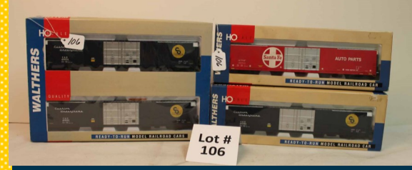
Lot # 106