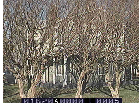
Last Photo Update 01/14/1997