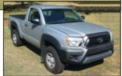
2012 Toyota Tacoma with 37,000 miles 4wd - sharp