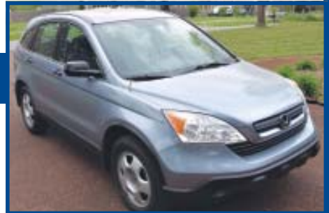
2008 Honda CRV 4 door – 23000 miles

TERMS on Real Estate: 15% down day of sale, balance with deed. Taxes of $1520 will be prorated. No Buyers Premium. Personal Property terms are cash or check day of sale. 4% charge for credit cards. Pictures, Plat, and more information on the website at www.garyauction.com (615) 302-2680