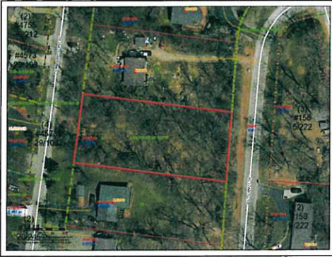
Lot 21 Sinissippi Point Road