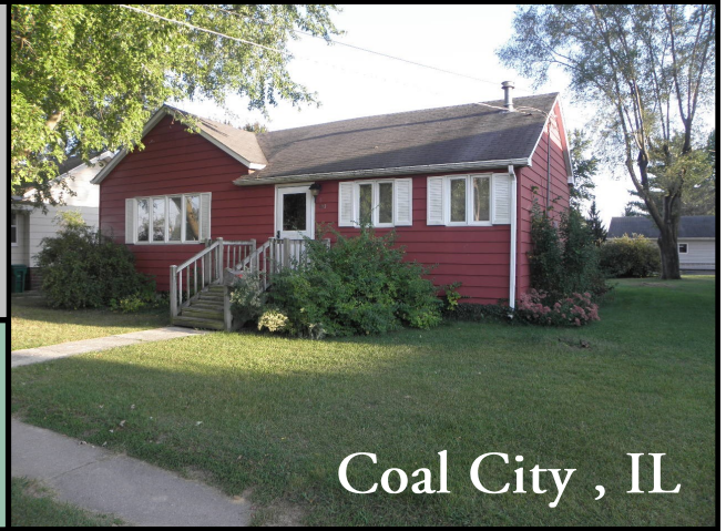
Coal City, IL

Location: 205 W Gordon Ave, Coal City, IL 60416