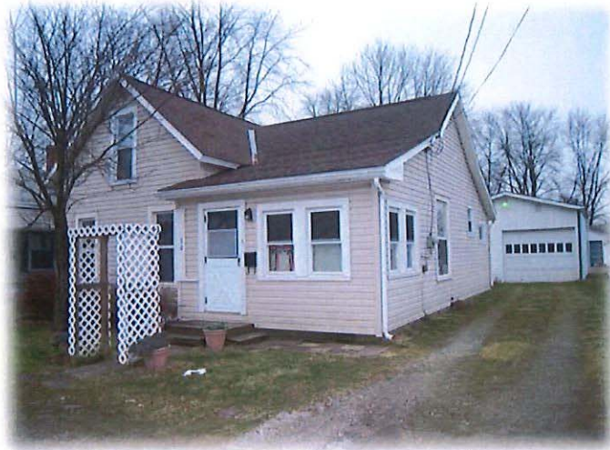
20 Herbert Street, Richwood, OH 43344