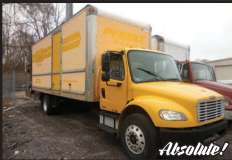
LOT# 104 | 1999 Freightliner FL70 24' Straight Truck