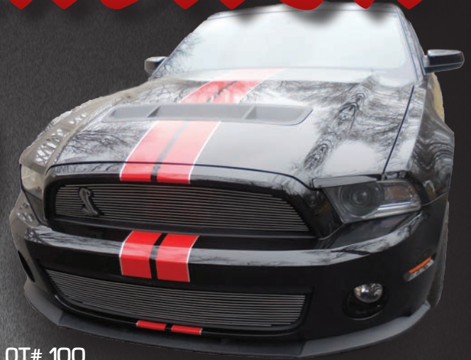
LOT# 100 2012 Ford Shelby GT500 SVT

Bidding Ends: Monday, April 23, 2018 at 2:00pm EST