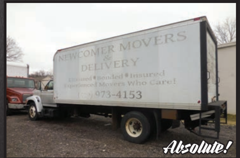
LOT# 106 | 1995 Ford F800 20' Straight Truck

Bid Online Today At PamelaRoseAuction.com