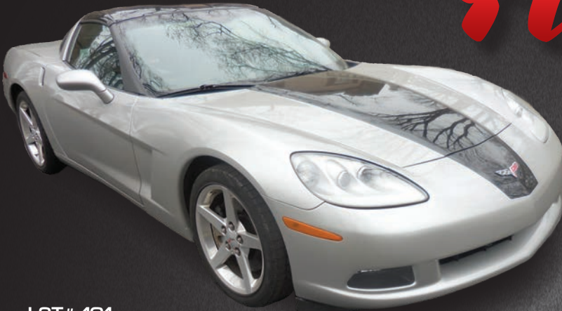
LOT# 101 2005 Chevrolet Corvette Coupe