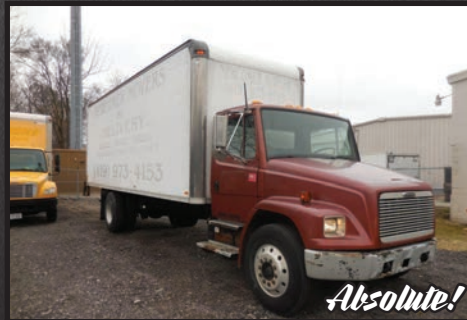
LOT# 105 | 2006 Freightliner M2106 24' Straight Truck