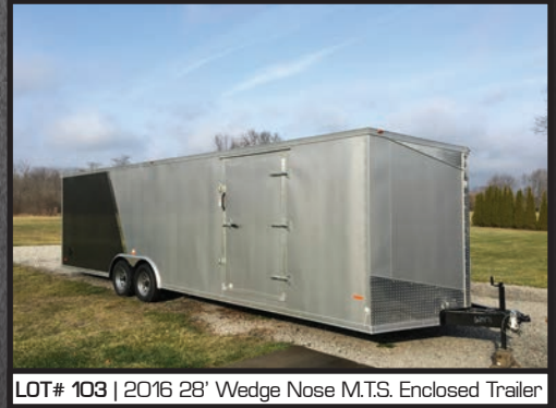
LOT# 103 | 2016 28' Wedge Nose M.T.S. Enclosed Trailer