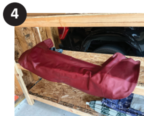
Convertible Boot Cover For 1987 Mustang GT