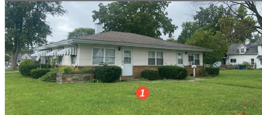
Lot #1 1,557+/- SF Twinplex

TITLE: A guaranteed certificate of title will be provided at Seller's expense giving marketable title subject to existing easements and restrictions.