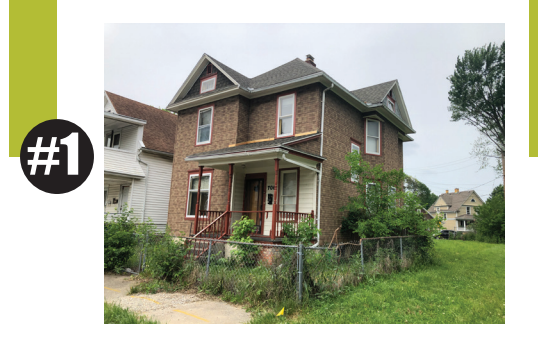
706 FEDERAL Street, Toledo, OH 43605 SINGLE FAMILY

Bidding Ends: Tuesday, JUNE 28, 2022 at 12:00 pm