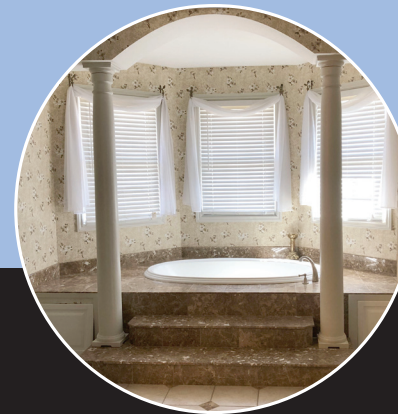
Luxurious Pillared Master Bath Spa

Open House: Thursday, April 25, 2019 at 12:00 pm