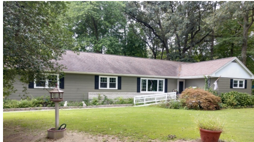
1900 Sq. Ft. On 3/4 acres

Bring your boat or RV, there's plenty of parking and no HOA, fenced back yard with above ground pool, nicely wooded, attached & detached garage, nice home with plenty of space to roam. Convenient location, 30 minutes to Delaware beaches. 3 Bed Rooms, 2.5 Bath. Hardwood Floors, Sun Room, Gas Fire Place, All appliances, Window Dressing, and some furniture. Fenced in back yard. Swimming Pool. One car detached garage, 10x10 Tool Shop with electric and lights.