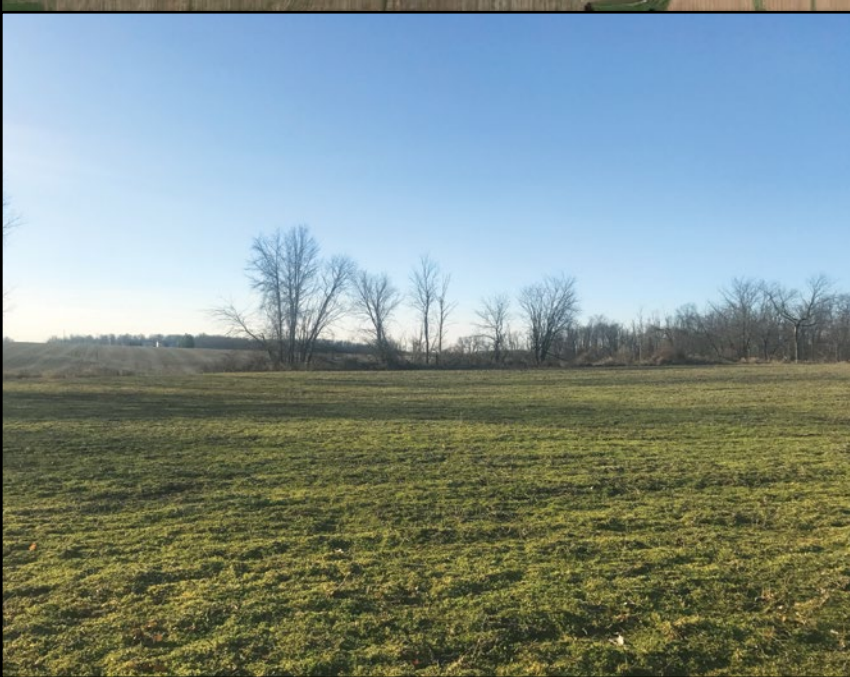
Parcel 4: 38 acres of wooded recreational land with 60' of frontage on the north side of TR 106. This parcel offers great character with a creek, 5 acres of open tillable land, and approximately 32 acres of wooded wildlife habitat. If you are looking for a secluded parcel to build your dream home or want your own spot to enjoy wildlife and the outdoors this parcel deserves your attention.