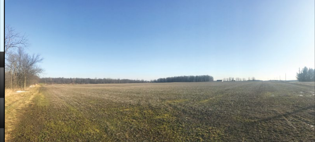
Parcel 3: 42 acres of slightly rolling farmland with a small wooded section on the back side. This parcel also offers good drainage and has been tiled where needed.