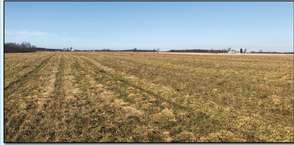
TRACT 1: 46 acres with 1524' of frontage on TR 106. The large majority of this parcel is open and tillable with a creek and small portion of woods on the south edge of the property. The tillable land is systematically tiled and offers great drainage.