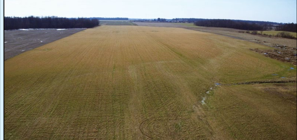
TRACT 2: 136.5 acres with approximately 115 acres of desirable cropland that is predominantly systematically tiled. The southeast 21 acres of this parcel is wooded.