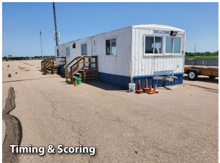
Timing & Scoring