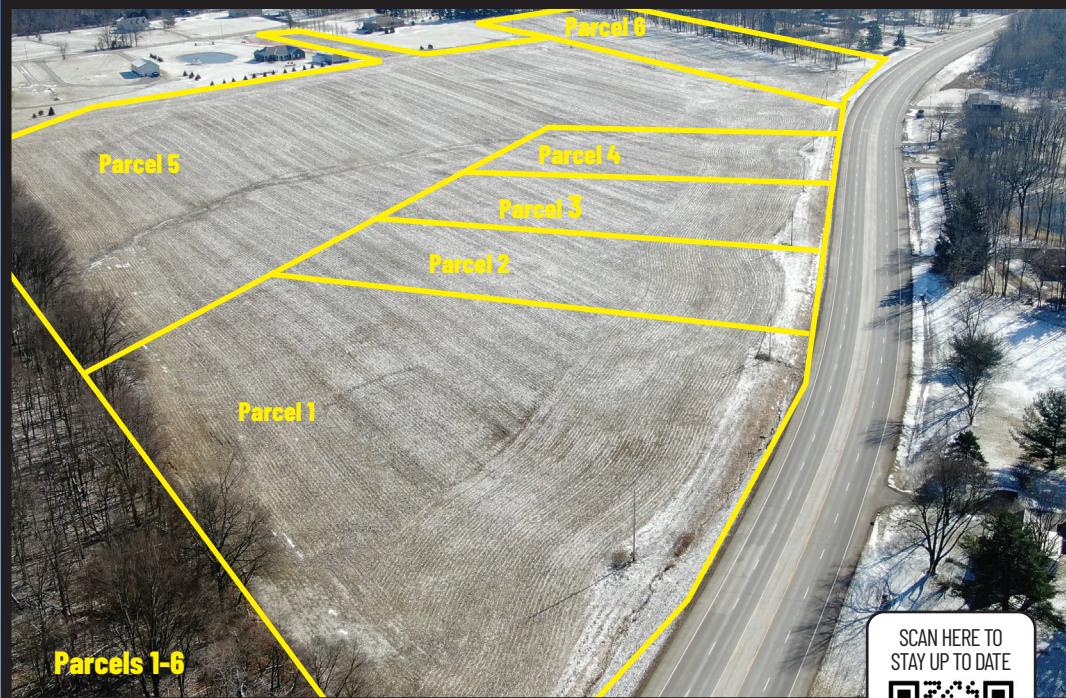
South of Shelby, on St. Rt. 39

Building Lots – Wooded – Tillable – 8 Parcels – Convenient Locations