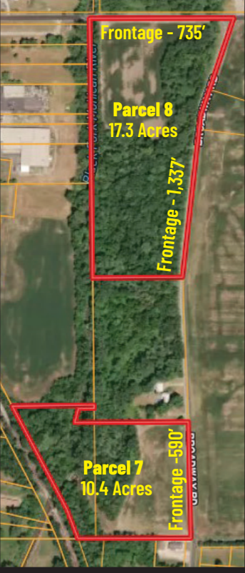
East of Shelby, on Broadway Rd.

Terms: The successful purchaser(s) will be required a non-refundable 10% down payment due the day of the auction with the balance due at closing within 45 days. A 10 % buyer's premium will be added to the final bid to determine the purchase price. All Real Estate taxes will be current and prorated to the day of closing. Any desired inspections need to be made prior to the auction. Additional details are available at www.RES.bid .