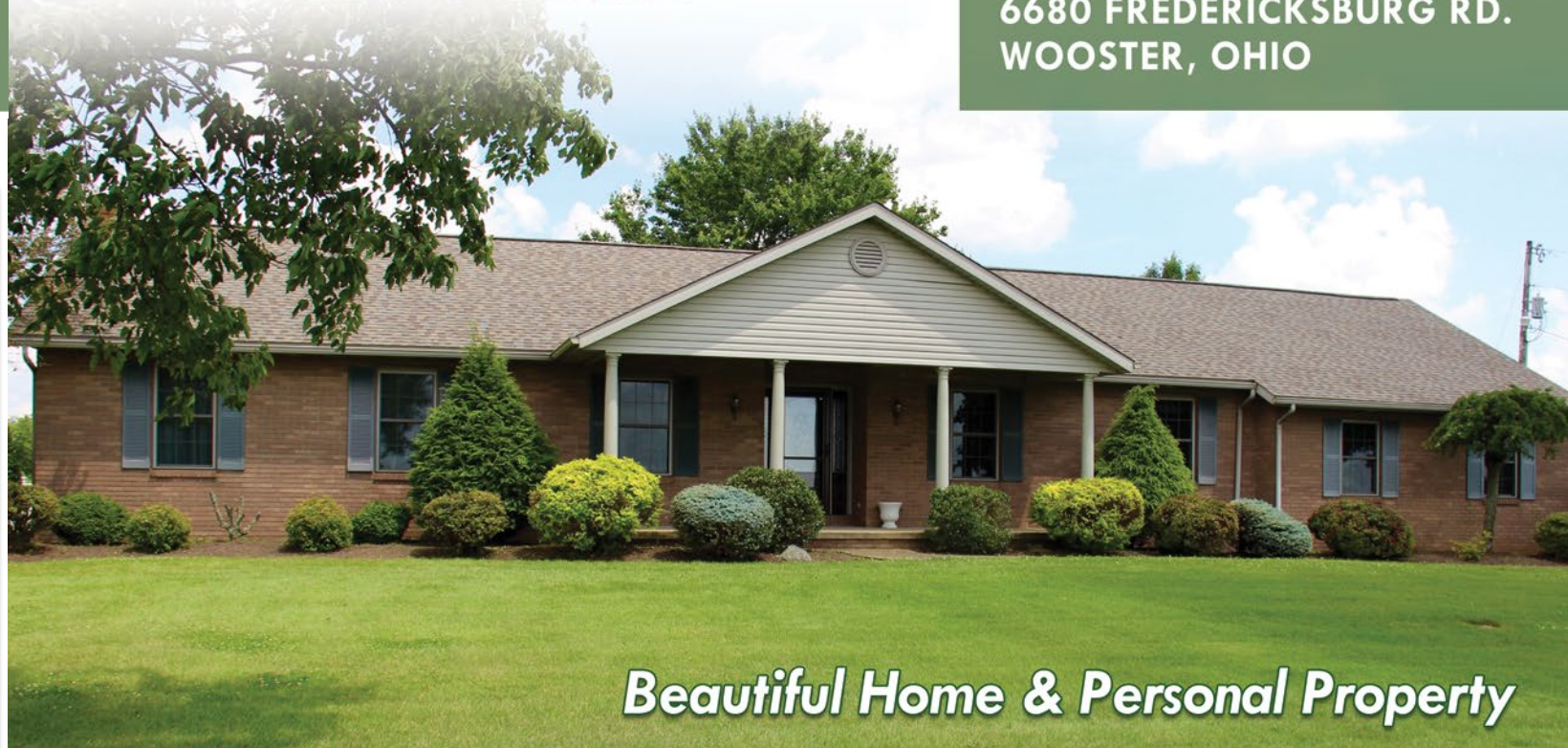
Beautiful Home & Personal Property