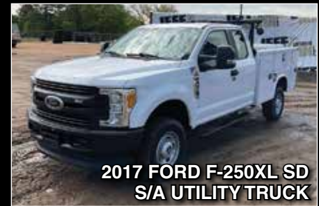
2017 FORD F-250XL SD S/A UTILITY TRUCK

AUCTION PREVIEW IS MONDAY, MAY 16TH THROUGH AUCTION DAY