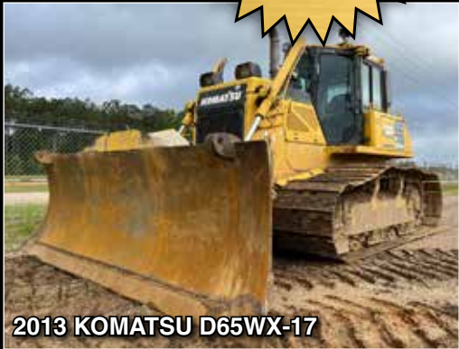
2013 KOMATSU D65WX-17