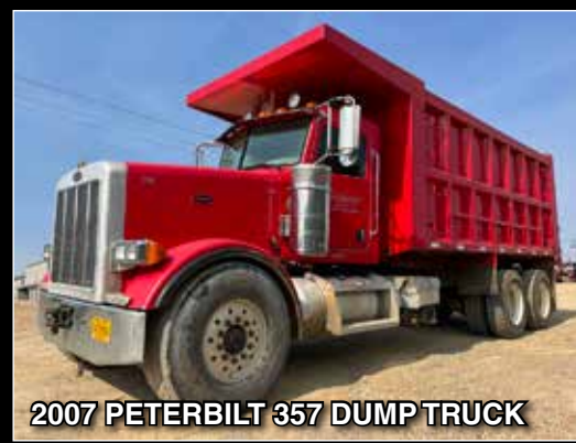
2007 PETERBILT 357 DUMP TRUCK