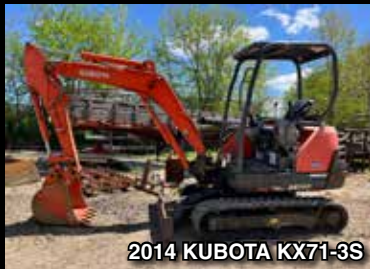
2014 KUBOTA KX71-3S

LIVE ONSITE & ONLINE AT BROOKLYN, MS MAY 20-21