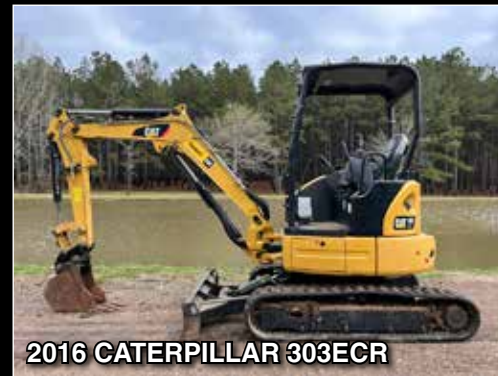
2016 CATERPILLAR 303ECR