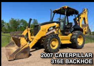
2007 CATERPILLAR 316E BACKHOE