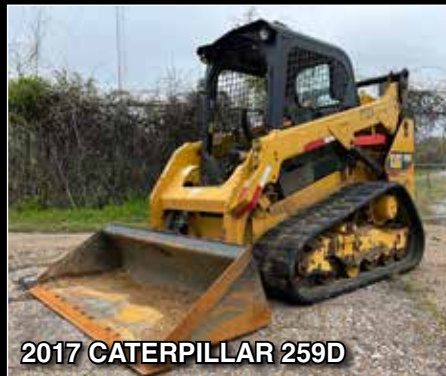
2017 CATERPILLAR 259D