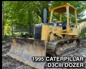
1995 CATERPILLAR D3CIII DOZER