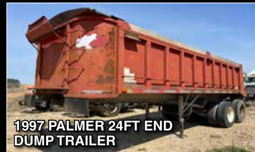
1997 PALMER 24FT END DUMP TRAILER

JEFF AUCTIONEERS MARTIN IN C. Experience the Difference!