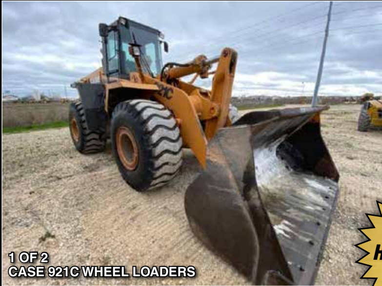
1 OF 2 CASE 921C WHEEL LOADERS