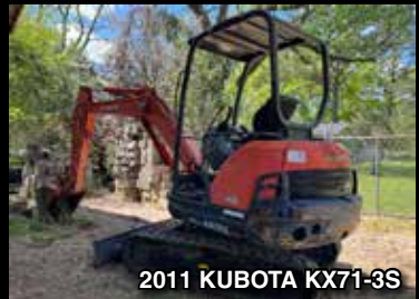
2011 KUBOTA KX71-3S