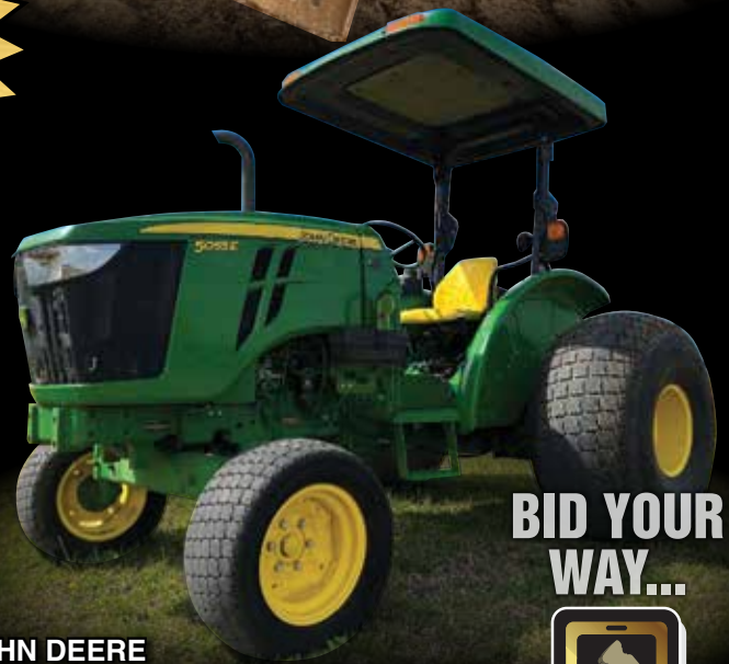
JOHN DEERE 5055E TRACTOR