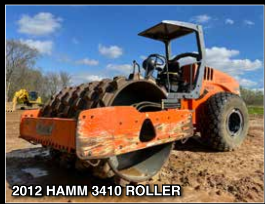
2012 HAMM 3410 ROLLER

FEATURING: HEAVY CONSTRUCTION EQUIPMENT, TRUCKS, TRAILERS, FARM EQUIPMENT, VEHICLES AND MISC. ITEMS