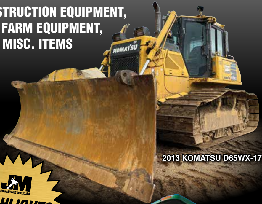
2013 KOMATSU D65WX-17

JM JEFF MARTIN AUCTIONEERS, INC. HIGHLIGHTS ONLY