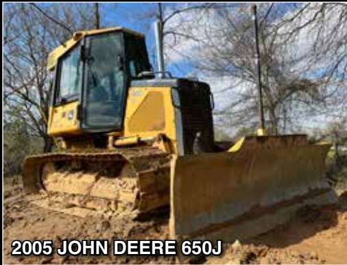
2005 JOHN DEERE 650J

JM JEFF MARTIN AUCTIONEERS, INC. HIGHLIGHTS ONLY