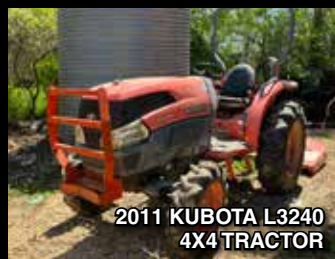
2011 KUBOTA L3240 4X4 TRACTOR