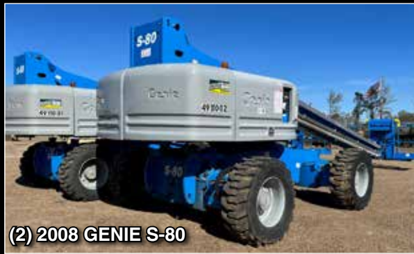
(2) 2008 GENIE S-80