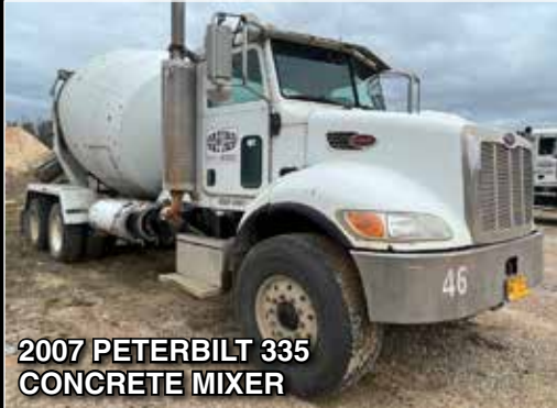
2007 PETERBILT 335 CONCRETE MIXER