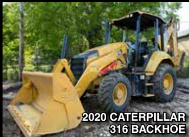
2020 CATERPILLAR 316 BACKHOE