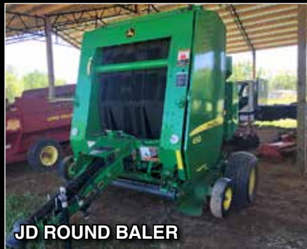
JD ROUND BALER