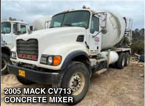
2005 MACK CV713 CONCRETE MIXER