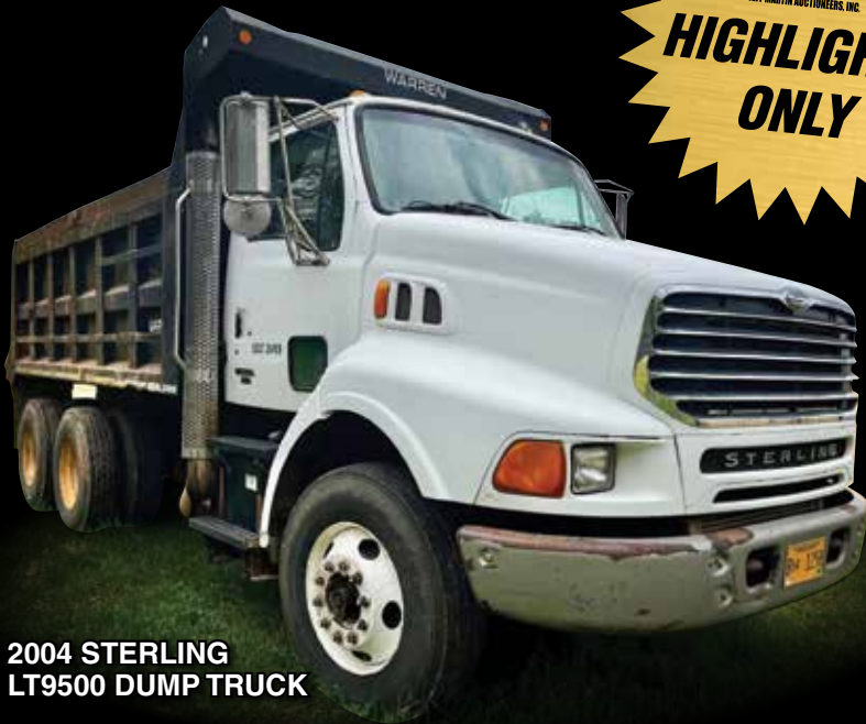
2004 STERLING LT9500 DUMP TRUCK

JM JEFF MARTIN AUCTIONEERS, INC. HIGHLIGHTS ONLY