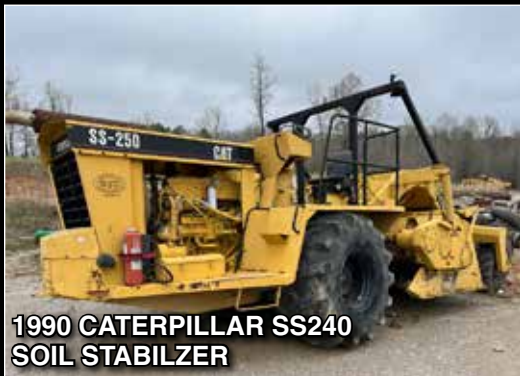
1990 CATERPILLAR SS240 SOIL STABILIZER