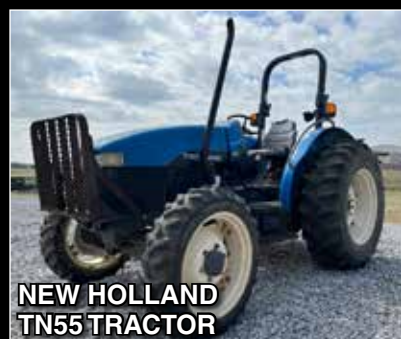
NEW HOLLAND TN55 TRACTOR