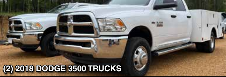
(2) 2018 DODGE 3500 TRUCKS