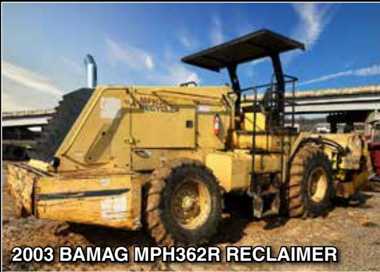
2003 BAMAG MPH362R RECLAIMER