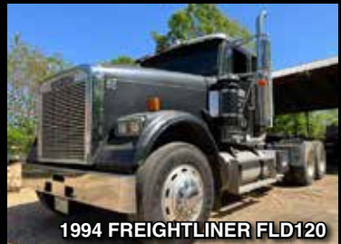
1994 FREIGHTLINER FLD120