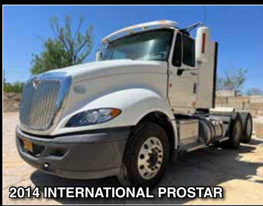
2014 INTERNATIONAL PROSTAR