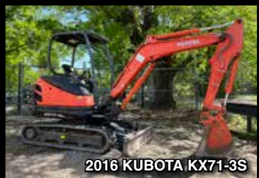
2016 KUBOTA KX71-3S

FEATURING WELL MAINTAINED ITEMS FROM HARVEY CONSTRUCTION COMPANY