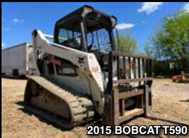
2015 BOBCAT T590