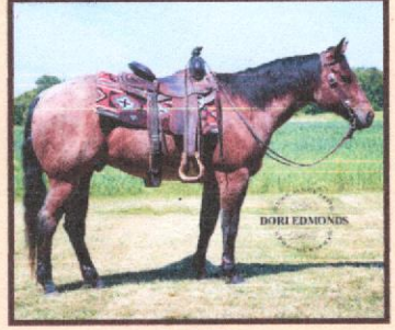
Lot 452 4 yr AQHA Gelding Sold for: $14,000 Seller: Stutzman Family Horses Clare, MI