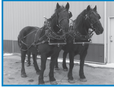
Ross & Boss