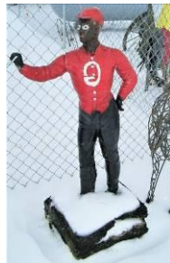
Black Horse Jockey,