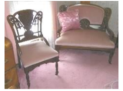
Ornate Chair & settee – tiger oak,