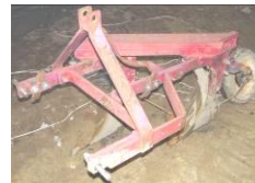
3 pt. IH 2-14 plow, 3pt King Kutter 6' disc, 3pt carry all,