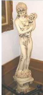
4' Tall Lady W/Grapes Statue,