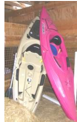
2) Sun Dolphin Kayaks, tan Journey 10 & pink Aruba 10,