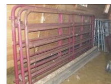
Pipe Iron Gates: 3 each 4', 8', 10', 12', 6) cyclone fencing gate panels- 10', 8' x 10' alum. gates, 3) grates, 9) curve top 6x10 dog cyclone gated unit,