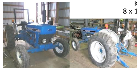
Ford 4630 Dsl Tractor ser#BD56058, has HD 3pt, pwr. steering, shuttle shift, 60 hp, 2409 hrs,