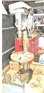
Craftmaster Bench Drill Press,