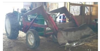
Oliver 1365 dsl tractor w/loader, 3pt, center link, ser#735902