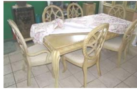
Blondewood- Hometown Formal Dining Room Set, lg. table w/6 curved top chairs, English style buffet,