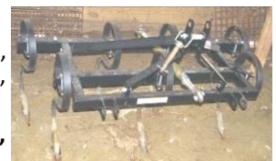
3pt. DR 4' cultivator,