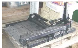
Reese Hitch Battery Scooter Hauler, Reese receiver,