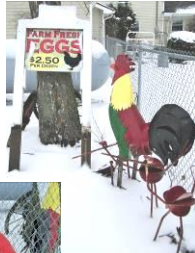
Metal Rooster & Misc. Ornaments