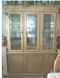
China Cabinet, 55" w x 82" h

2) bench 3-4 drawer Craftsman tool chests, 2) Dremel tools, Rotozip tool kit, DELTA: double bench grinder, mortising attachment, table saw, 1" belt sander, Skil plunge router #1835, Steele 4-1/2 side grinder, Lg. pipe wrenches, crescent wrenches, Wet tile cutter, power nibbler, B&D: 1-1/2 hp router, palm sander, workmate bench, ele. drill, Hickory 16 pc. Forstner bit set, 2) arrow ele. Staplers, 2) material handle stands, MILWAUKEE: 7-1/4 circular saw, c-clamps (3"-12"), grease guns, sledge hammer, ax, forks, amp probe, masonry tools, corn knife, CRAFTSMAN: 16" scroll saw on stand, 3 hp 10" compound miter saw, Router table, 6" planer, 2.75 hp radial arm saw, ele. angle framing nailer, router millwork mold unit, router dovetail unit, 1/4hp sander, SEARS: router, 5/8 hp plate jointer, HDC 14" bandsaw & 4" belt x 6" disc sander, 8' wood bench w/under vise, file cabinet, Makita reciprocating saw, Chicago battery drill, 3/4 ton chain come-a-long, Air grease barrel & pump, Bar & pipe clamps, fence staples, screws, 1/2" heavy log chain, 2) lg. binders, roll chain, pr. wood clamps, Pioneer hydr. Ends, speed wrench, sewer snake, 100' extend cords, blue metal screw set, taps, allen wrenches, drill bits, jill blocks, lg. drill bits, vise grips, gear puller, lynch pins, blocks, reamer, 2) bottle jacks, electrical parts, nuts, bolts, plastic shelving, tent stakes, disc parts, 220 ele. Cord, ceramic heaters, Honda 2600 psi power washer, Old platform scales, 3-ton floor jack,