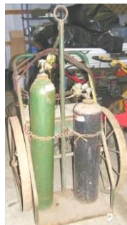
Set of acetylene torches w/cart, Miller Thunderbolt AC/DC welder, gloves, 2) welder helmets, roll around bench,