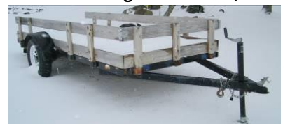
5'x12' single axle trailer,

MISC: Ele. Fan, plastering tools, Rigid shop vac, cement ballflow 4) heated buckets, iron shelf, air tank, 6' & 8' wooden ladders, cams hinged wood work item, folding tables, charcoal grill, ele. Fence, paint drop cloth, alum. Ext. ladder, bushel baskets, 2) old chest freezers, 4) live traps,