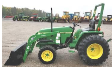
John Deere 790 compact loader tractor