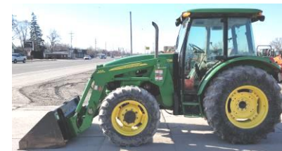
John Deere 5093E ag loader tractor