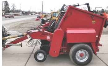
Case Int'l 3450 round baler