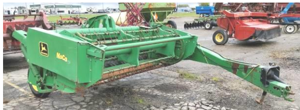
John Deere 710 haybine