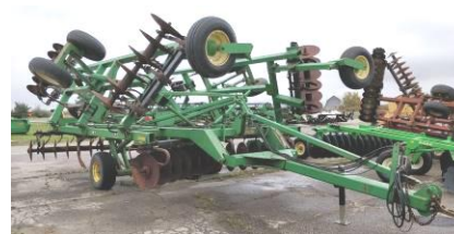
John Deere 512 disc