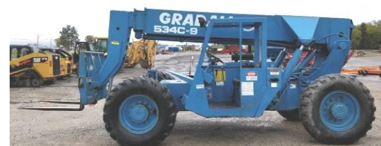
Gradall 534C-9 boom forks sky tracker