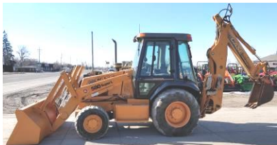
Case 580 Super L backhoe

Hosted by Tosch Auction Service – www.toschauction.com – Online Bidding by Proxibid - Item List Subject to Additions or Deletions – Quality Items Added Daily - Item Photos and Info. to be Posted on www.toschauction.com the Week of the Sale - Financing through Ag Direct – Loader and Dock Available – Trucking Available - Items Must be Paid for Sale Day with Cash, or Check with ID - No On-Site Buyer's Premium – Items to be Removed Within 30 Days - Call Joe Rosseel 586-206-1338 or Tosch's 810-395-4985 with Questions