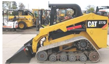
CAT 277D track skidster