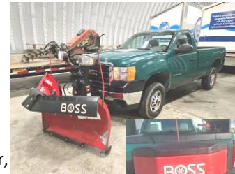
2013 GMC Sierra 2500, 4 wd pickup 8' box, 8'2" power V-Boss plow & TGS 600 rear salt spreader,