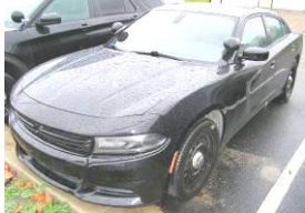
2021 Dodge Charger, AWD,