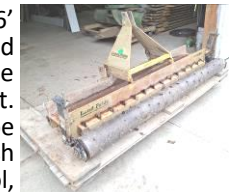
6' Land Pride 3 pt. landscape finish tool,