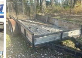
Landscape trailer, tandem axle w/drop gate,