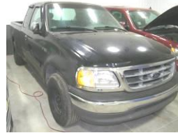
2002 Ford Pickup, ext. cab, 2wd, black, 213,833 mi,