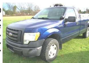
2009 FORD F150 4WD pick up 8' box, WeatherGuard side & across the bed, alumn. Tool boxes, 110,612 mi,