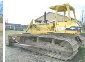
Komatsu D68P lg. dozer, 12 ft blade, 37-1/2" wide track pads, $5,000 worth of new parts, track pads & blade parts, shows 3650 hrs, - dozer is located at 3380 Keewahdin Rd, Ft. Gratiot, MI,

TERMS OF SALE: are CASH DAY OF SALE. Cashier's Or Traveler's Checks, Bank Money Order, Michigan Personal Or Company Checks ONLY WITH Bank Letter Of Authorization. Payment Is Required In Full On Day Of Sale. Nothing Is To Be Removed Until Settled For - All Sales Are Subject To 10% Buyers Premium and 6 % Mi Sales Tax