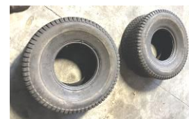
Turf tires: 4) large, 4) small,