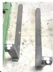
John Deere tractor forks,