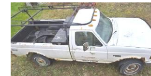
1995 Ford F250 4wd, pickup, 5.8 L V-8 A/T, lock out hubs, Meyers pump 8' Western snow plow, ladder racks, (no brakes-line rusted out),