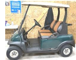
2005 Club Car gas runs good,