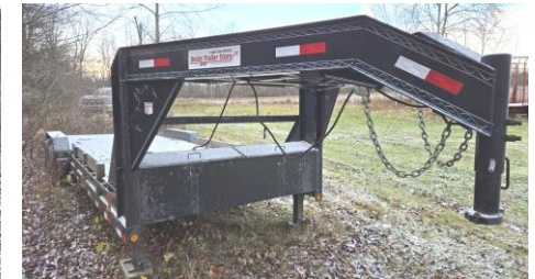
2016 LOADTRAIL 24ft.x7ft wide dovetail, tandem 7000lbs.Axle GOOSENECK Trailer w/extra 5th wheel hitch & rear ramps & Traveler 9500lbs. Cable Winch