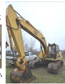
CAT 320L excavator, shows 7900 hrs,