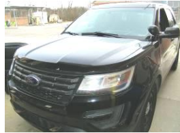
2016 Ford Explorer, 55,126 mi,