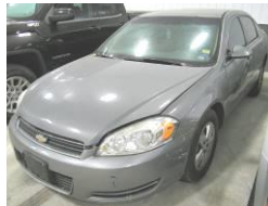
2007 Chevy Impala, 4 dr, charcoal gray, 231,542 mi,