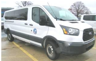
2016 FORD Transit 350, 3.7 L. AT pass. Van, white, 233,641 mi, Frt. Dmg.