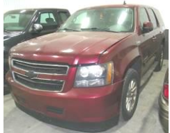
2008 Chevrolet Tahoe K1500 Hybrid, 6.0 engine, 4wd, maroon, 192,047 mi,