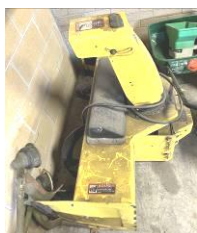
2) John Deere 47" snow blower w/ shafts.