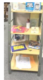
Metal shelf unit,