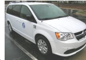
2018 Dodge Grand Caravan, 2010 white, Chevy Tahoe, 2wd, white, 188,619 mi,