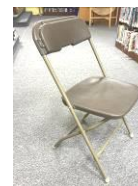
(8) Metal chairs,