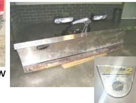
Fischer stainless steel, 9' snow plow,