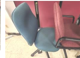
Cloth covered Chairs: 1) blue, 3) maroon,