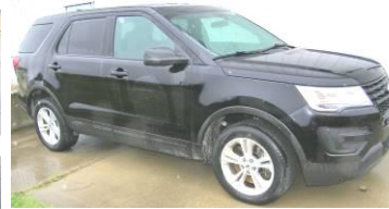
2018 Ford Explorer AWD, 3.7L Grp, 4 dr, flex fuel, cloth interior, blk, 55,453 mi,