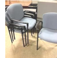
4) chairs, 2004 GMC Sierra V-8, 4x4 187,000 miles, runs and drives good,