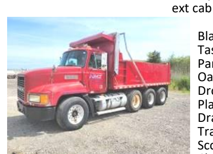
1993 MACK tri axle.16' dump truck, mdl ch613, 8 spd, hilow trans, EM7-300 Mack, 50K on motor, 300k mi.