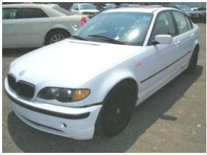
BMW, white, 222,653 mi,