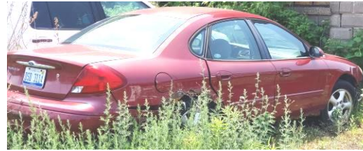
2003 Ford Taurus, maroon, 4 dr,