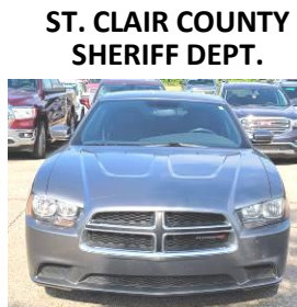
ST. CLAIR COUNTY SHERIFF DEPT.