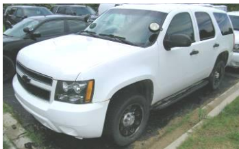
2009 Chevy Tahoe 4wd, 5.3 v8, white, 230,602 mi,