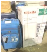
UNUSED ITEMS: Watches-4)smart watches,14)assorted men's watches, Ryobi hammer drill 18v combo, Traveler 1500 watt power inverter, 12 pc. Cresent brand socket set, Greenworks 18" corded chainsaw, 2) Cobra security cameras 720 p, Defiant security system, Shark Ion R71 robot vacuum, Panasonic 2.2 cu. Ft. microwave-white, Better Homes & Gardens table top firepit, Toshiba portable air conditioner-350 sq ft, Vizio 5.1 home theater sound system, Skyway & Protode suitcases, Nike Drifit shirts, Nike shorts, USED ITEMS: 46 Pr. Footwear-Nike, Jordan, Levi, New Balance, Stacy Adams, Fila, K-Swiss, Adidas, Timberland, Clark, Bunn coffee maker,