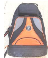
Barnett Cross bows: Penetrator and Wildcat, 16 pc cutlery set, 16 Piece Pfaltzgraf serving set, Black & Decker Microwave Oven, TFAL pots, Insignia TV, Bose Soundlink head phones, Bunn Coffee maker w/2 pots, gas weed whip, Klien tools backpack, asst. Craftsman Cordless tools, Coleman Grill,