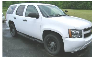
2014 Chevy Tahoe, 5.3 v-8, white, 181,725 mi,