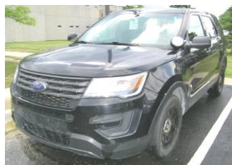
2016 Ford Explorer Interceptor, 2 wd, 3.7 V-6, black, 209,296 mi,