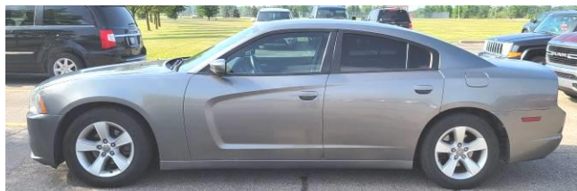
2012 Dodge Charger,

ALL ITEMS LOCATED AT: TOSCH'S AUCTION FACILITY: 15536 IMLAY CITY RD. (M-21) 1 MILE WEST OF CAPAC, MI 48014 JOHN TOMASCHKO – SALE MANAGER PHONE: 810-650-2730 INSPECTION MONDAY JUNE 21 ST FROM 8AM-5PM AT ABOVE ADDRESS