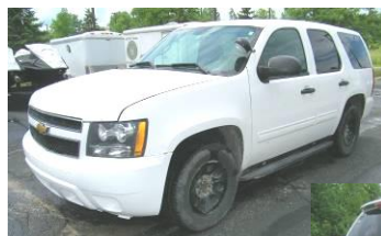
2012 Chevy Tahoe, 2 wd, 5.3 V-8. White,175,221 mi,