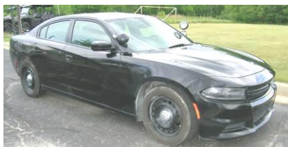
2018 Dodge Charger Interceptor, awd, 5.7 V-8, blk, 169,879 mi,