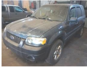
2005 Ford Escape (mtr. & trans Issue),