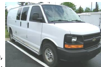
2013 Chevy Express van, 2 wd,6.0 V-8, 189,291 mi,