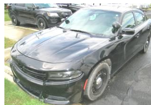
2018 Dodge Charger, (police), awd, 5.7 v-8, black, 151,691 mi,