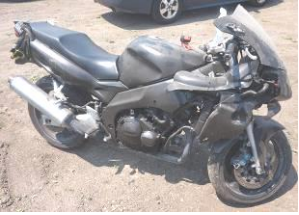
1997 Yamaha YZF-600R, black, (damaged, no key),