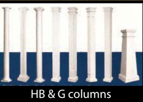
HB & G columns