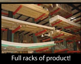
Full racks of product!

Several lengths and widths of Tendura composite deck T & G, Tendura composite 2x4 • XO brand cellular PVC exterior trim boards 1x4, 1x6, 1x8, 1x10, 4x8 • some dimesional lumber - #3 1x4 and 1x2 Misc Building Materials Several Stephenson cupolas (still in box) • versa tread • Wasco skywindows • bay window • trapezoid window • several misc. windows