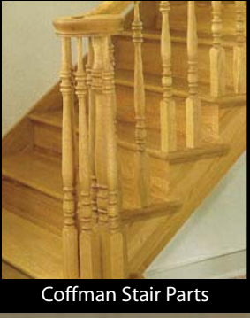
Coffman Stair Parts

Auctioneer's Day 1 Notes: This is truly a fantastic offering of NEW products in large quantities, making this a must attend auction. We will be running 2 rings simultaneously all day, please bring an associate.