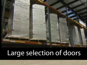
Large selection of doors