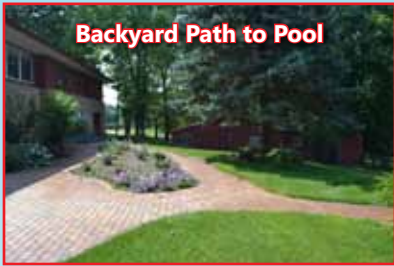
Backyard Path to Pool