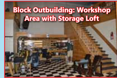
Block Outbuilding: Workshop Area with Storage Loft