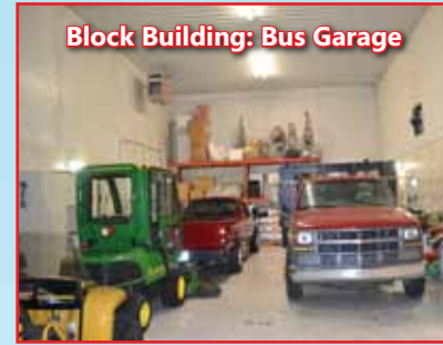
Block Building: Bus Garage