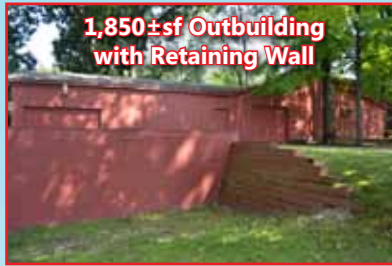
1,850±sf Outbuilding with Retaining Wall