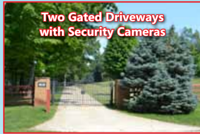
Two Gated Driveways with Security Cameras