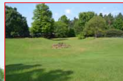
Boundaries Approximate