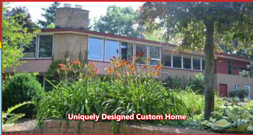
Uniquely Designed Custom Home

3,916±sf Block Outbuilding with 23' Ceiling, Bus Garage & Office 1,850±sf Outbuilding with Garage, Restroom & Office/Home Fitness Area