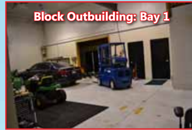
Block Outbuilding: Bay 1