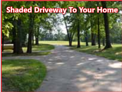
Shaded Driveway To Your Home