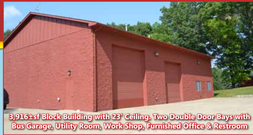
3,916±sf Block Building with 23' Ceiling, Two Double Door Bays with Bus Garage, Utility Room, Work Shop, Furnished Office & Restroom