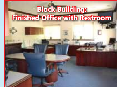
Block Building: Finished Office with Restroom