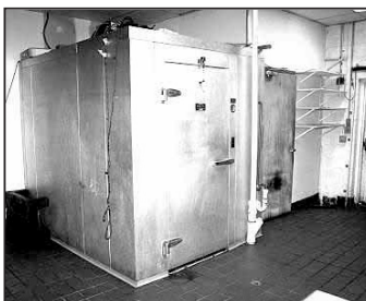
Kool Co. Walk-In Freezer