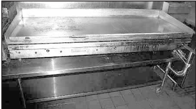
Anets Golden Grill 6 Ft.